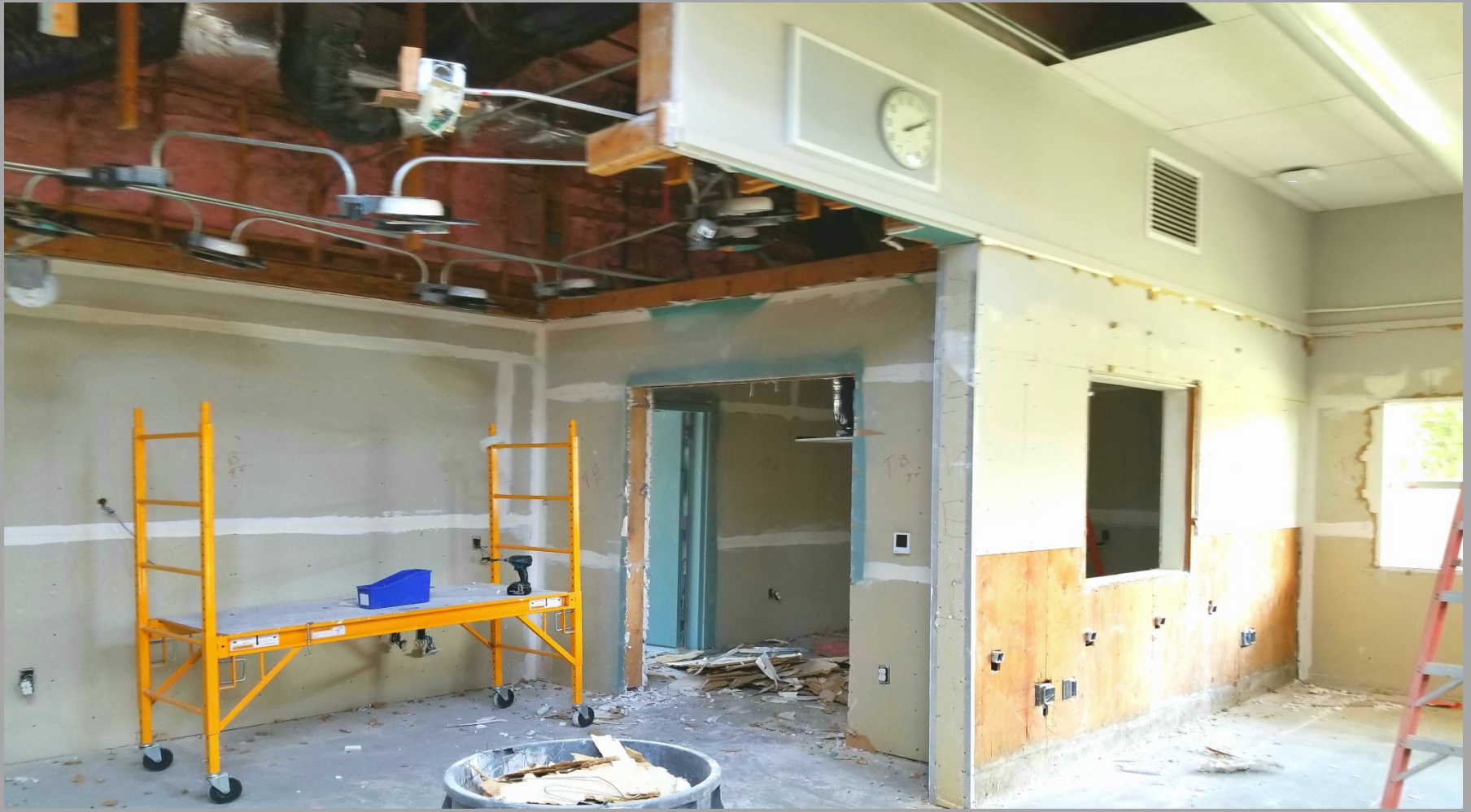
Viewing the Old Library. Demolition has started for remodeling of Building D.