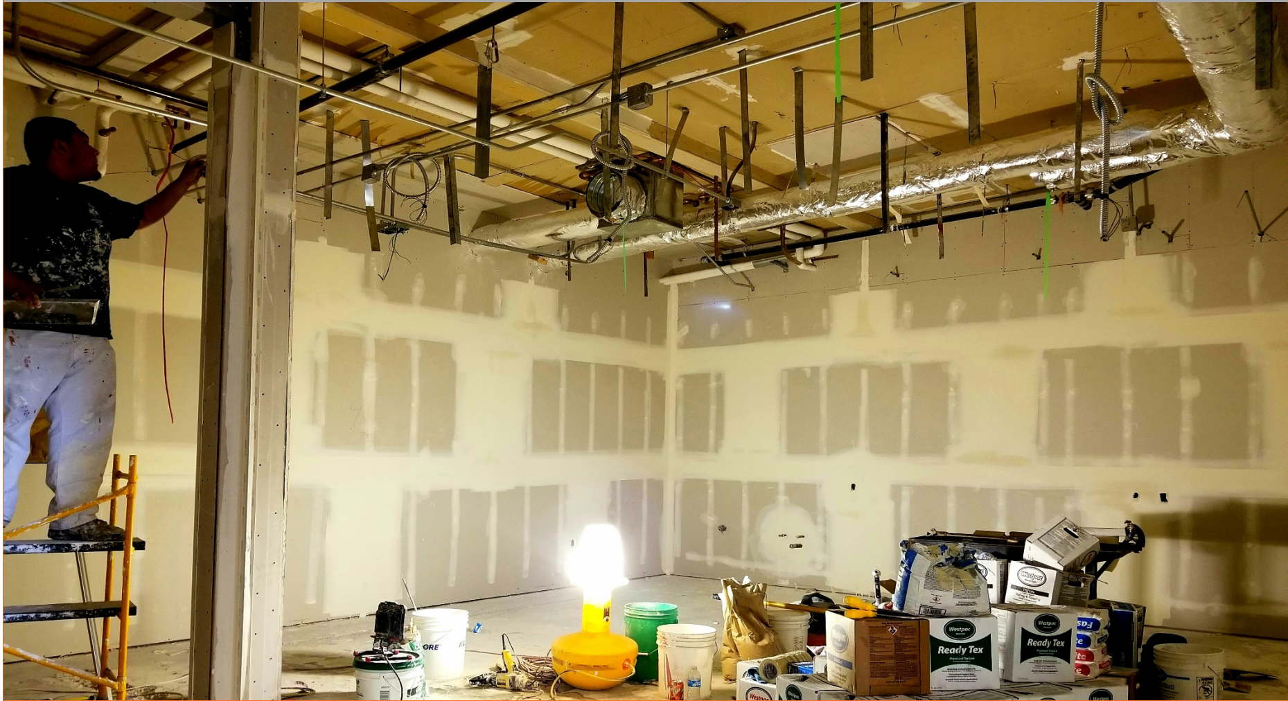
View of Modernization Work Inside of New Book Storage Room @ Building E.