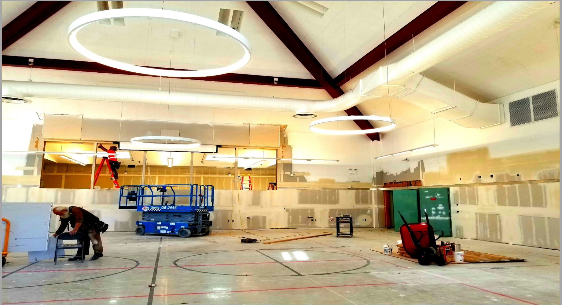
View of Modernization Work @ Building E - Looking North toward Computer Lab. Window wall had been framed & sheetrock was installed. Taping in Progress.