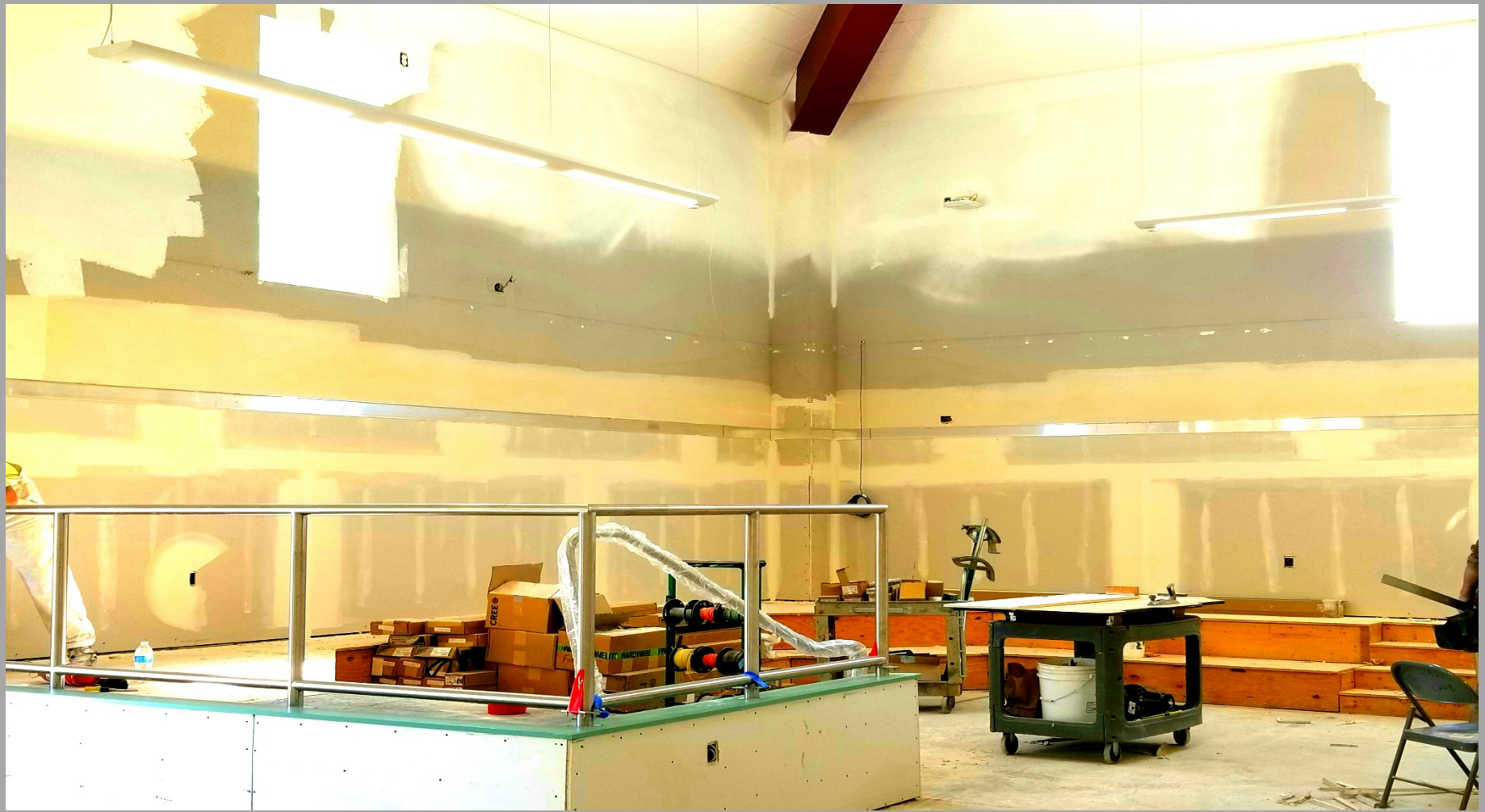
View of Reading Nook Stadium Seating @ Building E – Looking Southwest. Handrails installed & sheetrock finished. Taping in progress