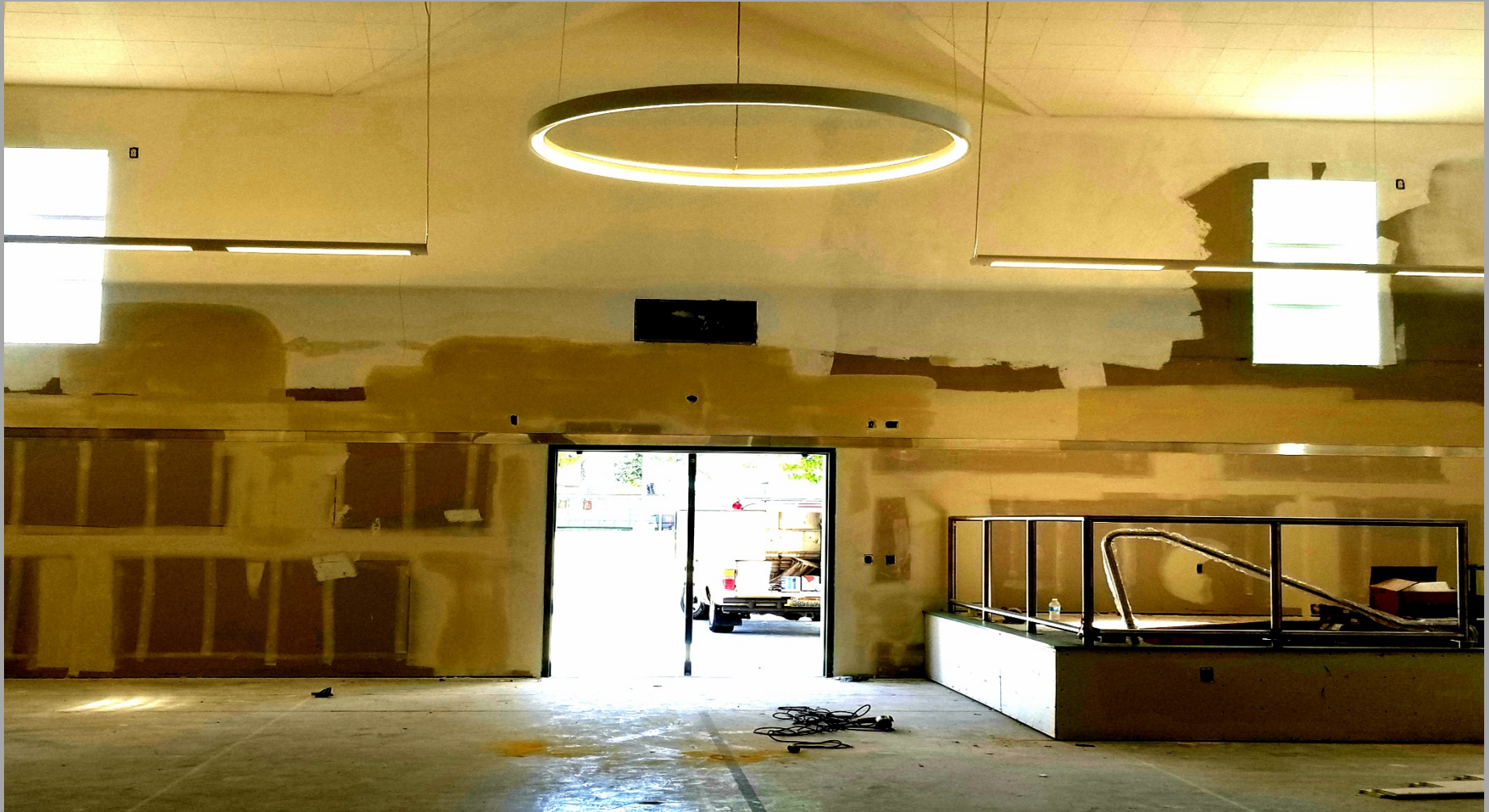
View of South Wall of New Library from Computer Lab., @ Building E. Sheetrock completed. Taping in progress.