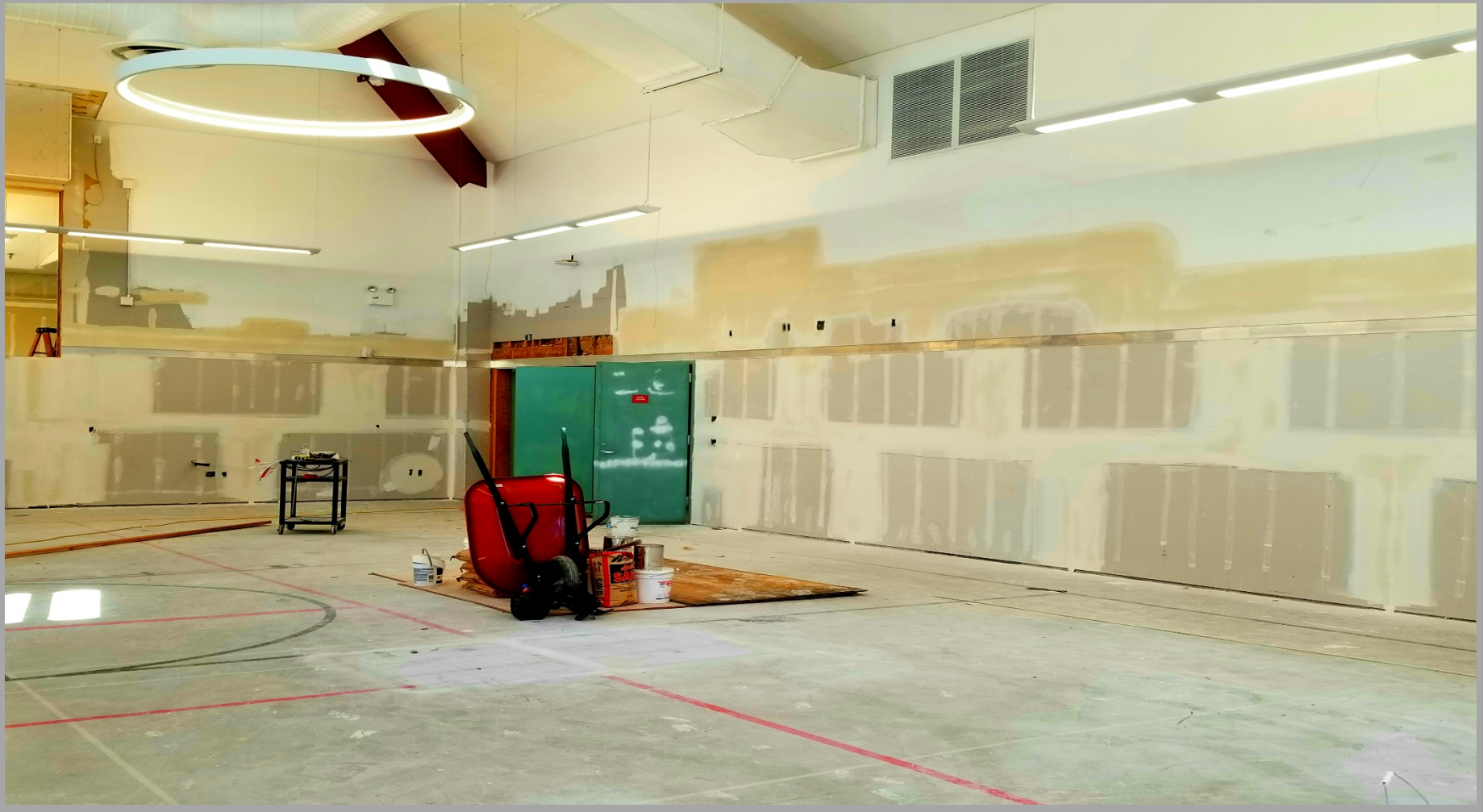
View of Modernization Work @ Building E - Looking Northeast toward Hallway & Book Storage Room. Sheetrock was installed.