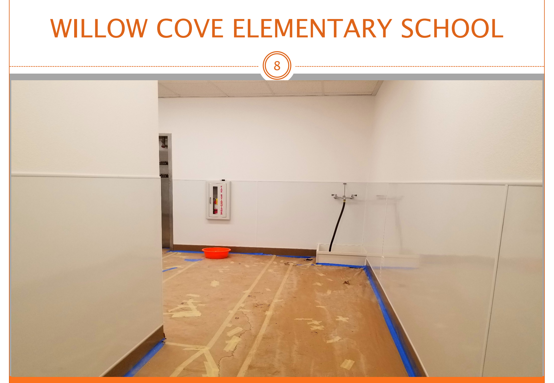
Building E – View of the Custodial Room with paper-protecting epoxy floor.