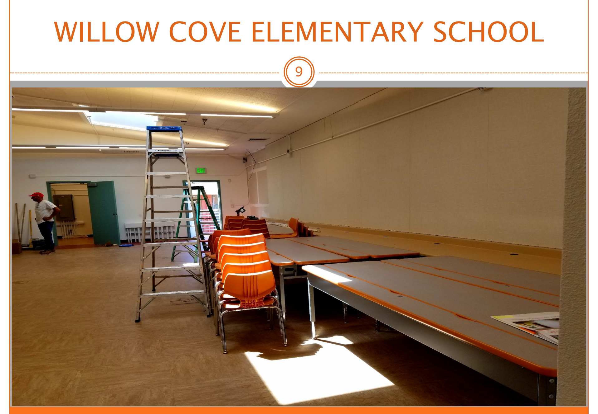
Building E - Computer room furniture tackable wall board installation nearly completed.