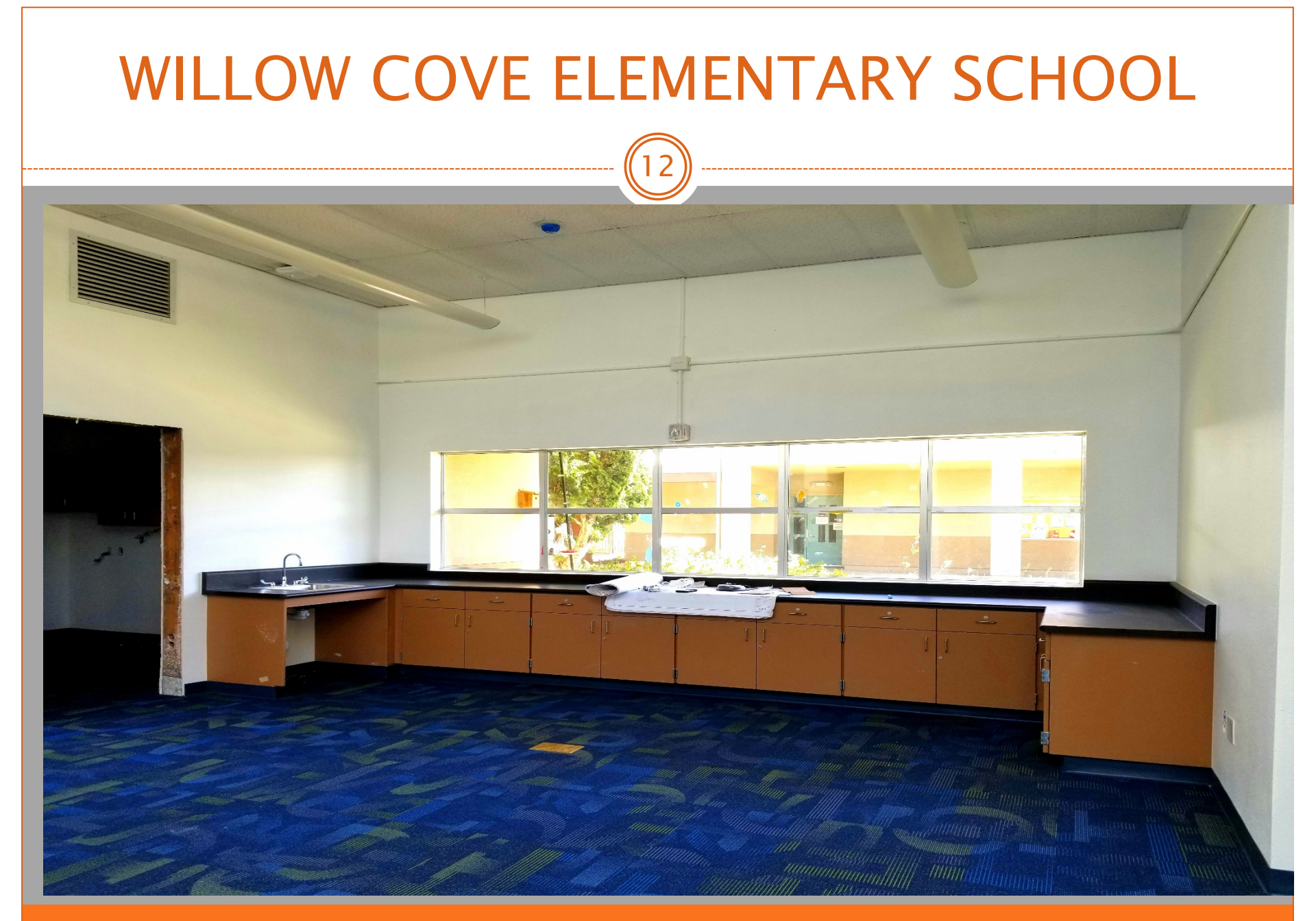
Building D - Carpeting and cabinets have been installed.