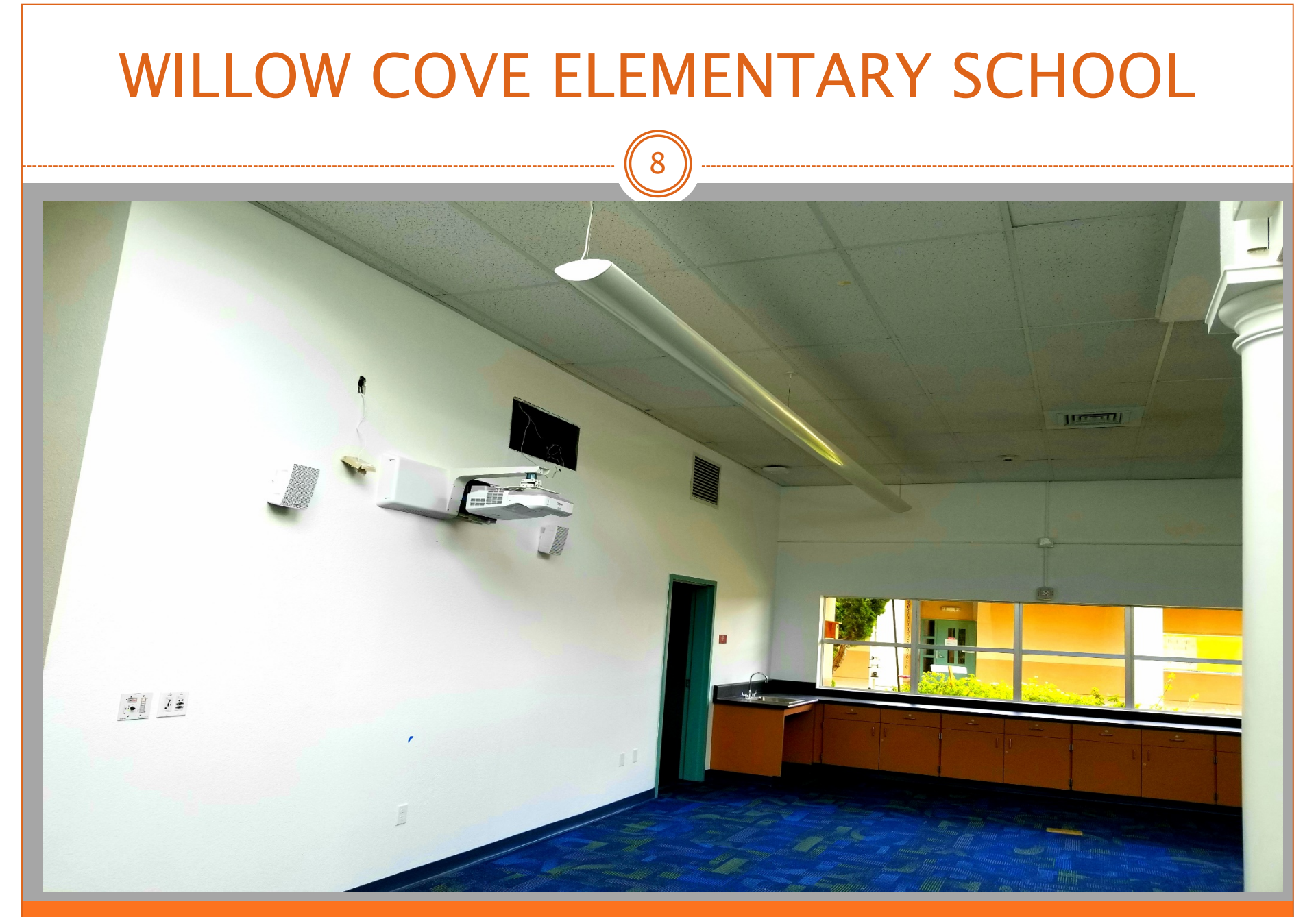
Building D - Projector has been installed on the wall. We are waiting for the white board.