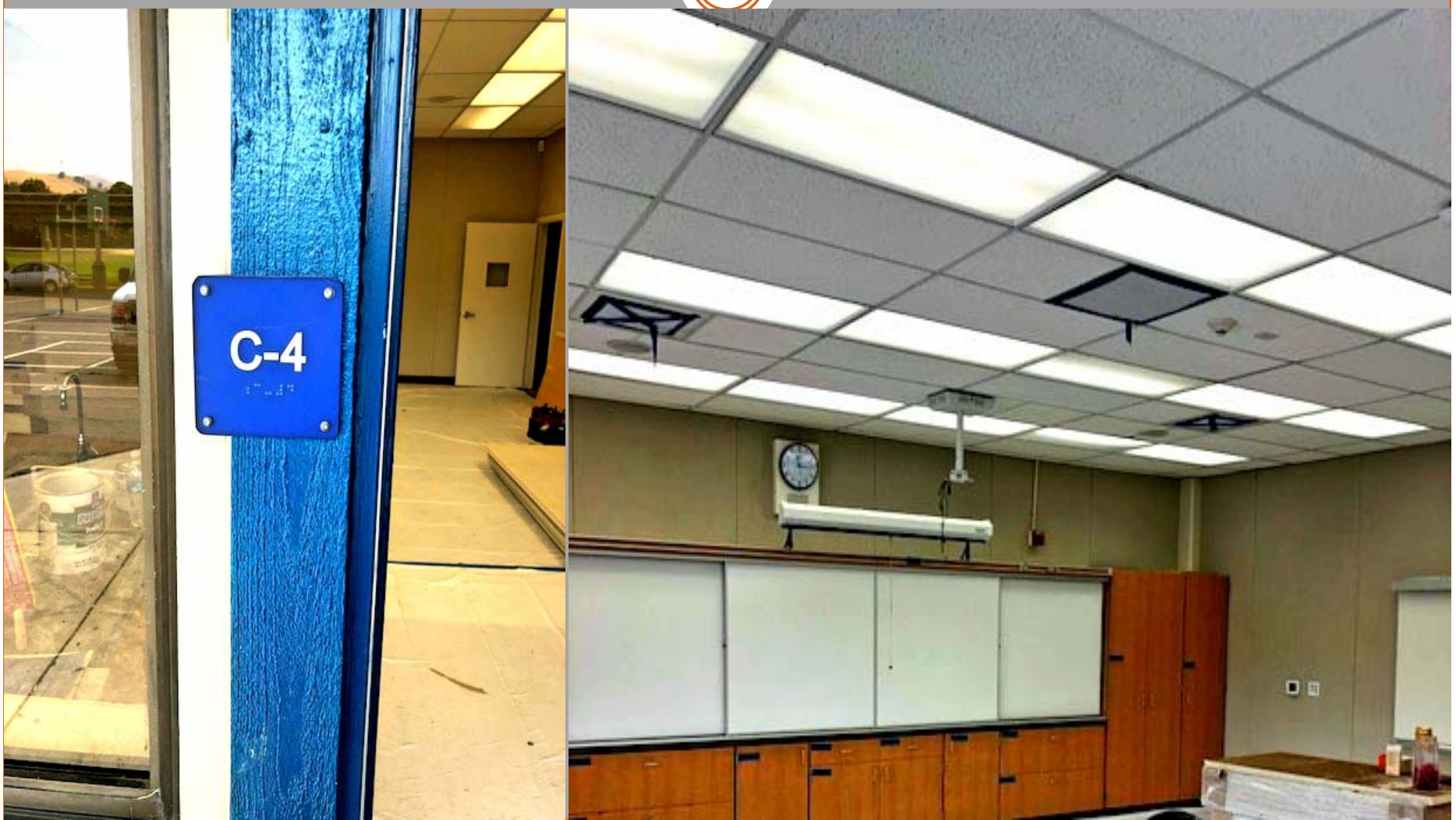
C-Pod - All new tack wall panel has been installed. New LED lighting and ceiling tiles has been installed in middle pod area.