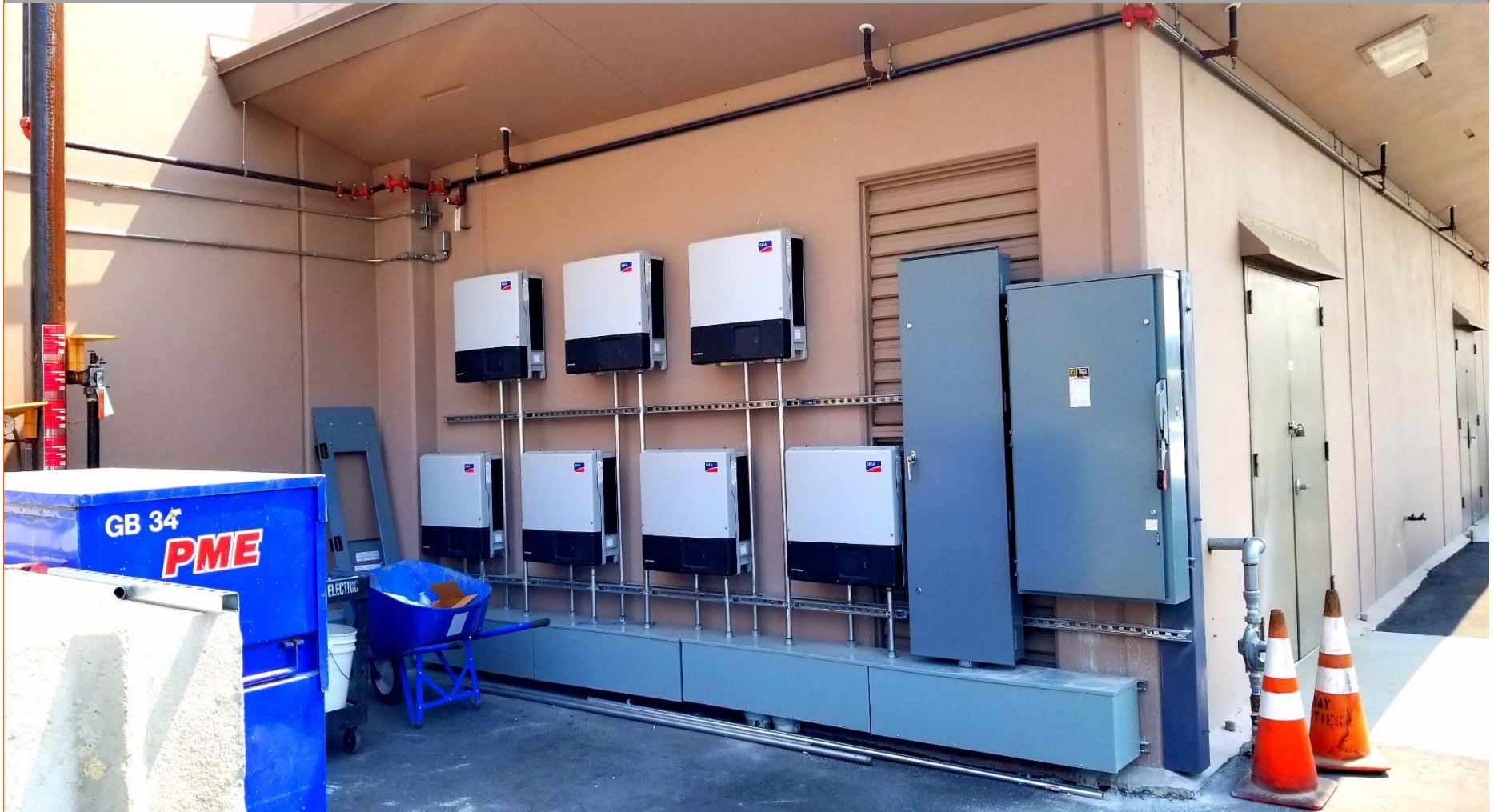
Solar panel and wind turbine inverters installed at MOT warehouse building.