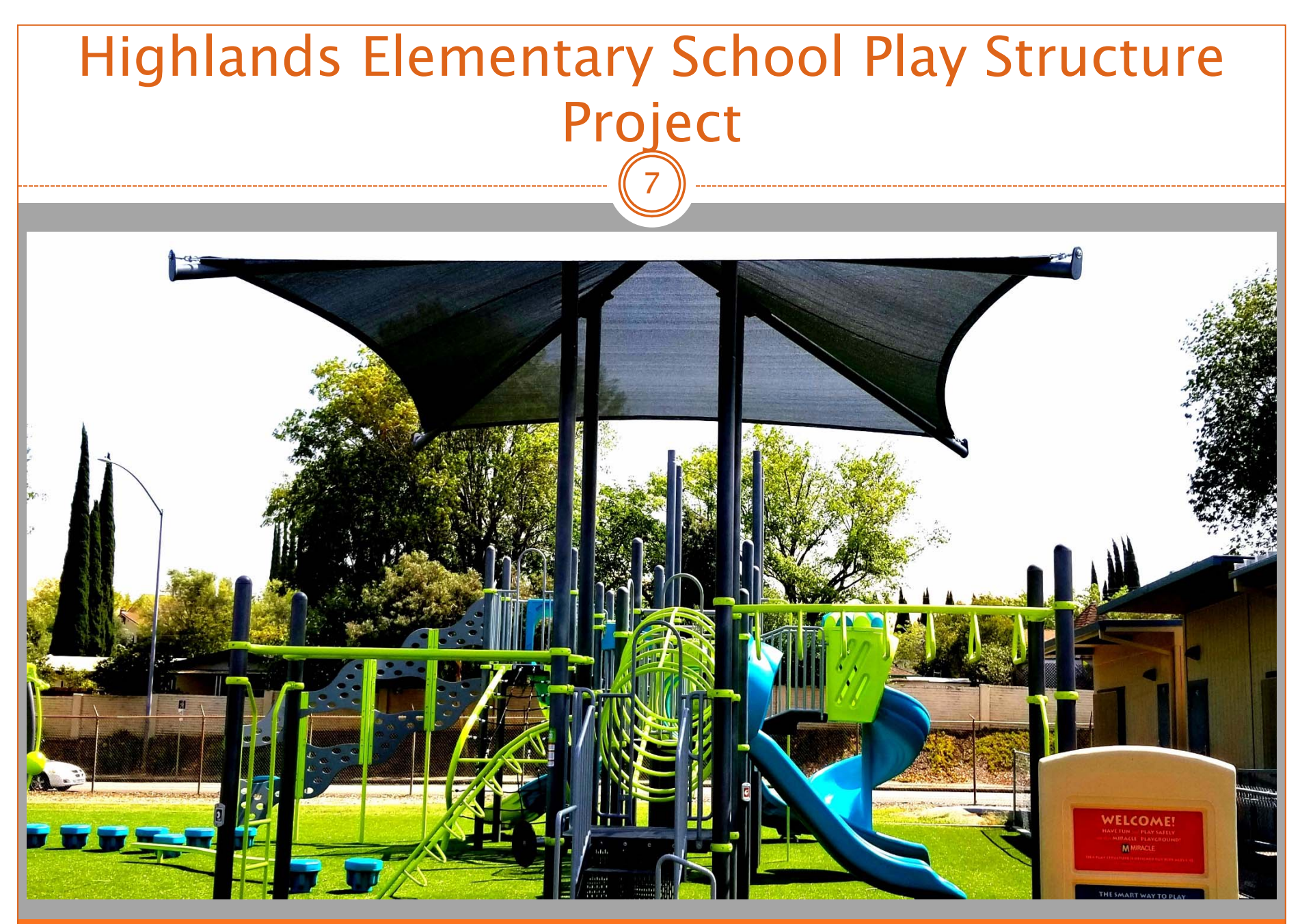
Play Structures Project at Highlands ES: Equipment is 100% completed.