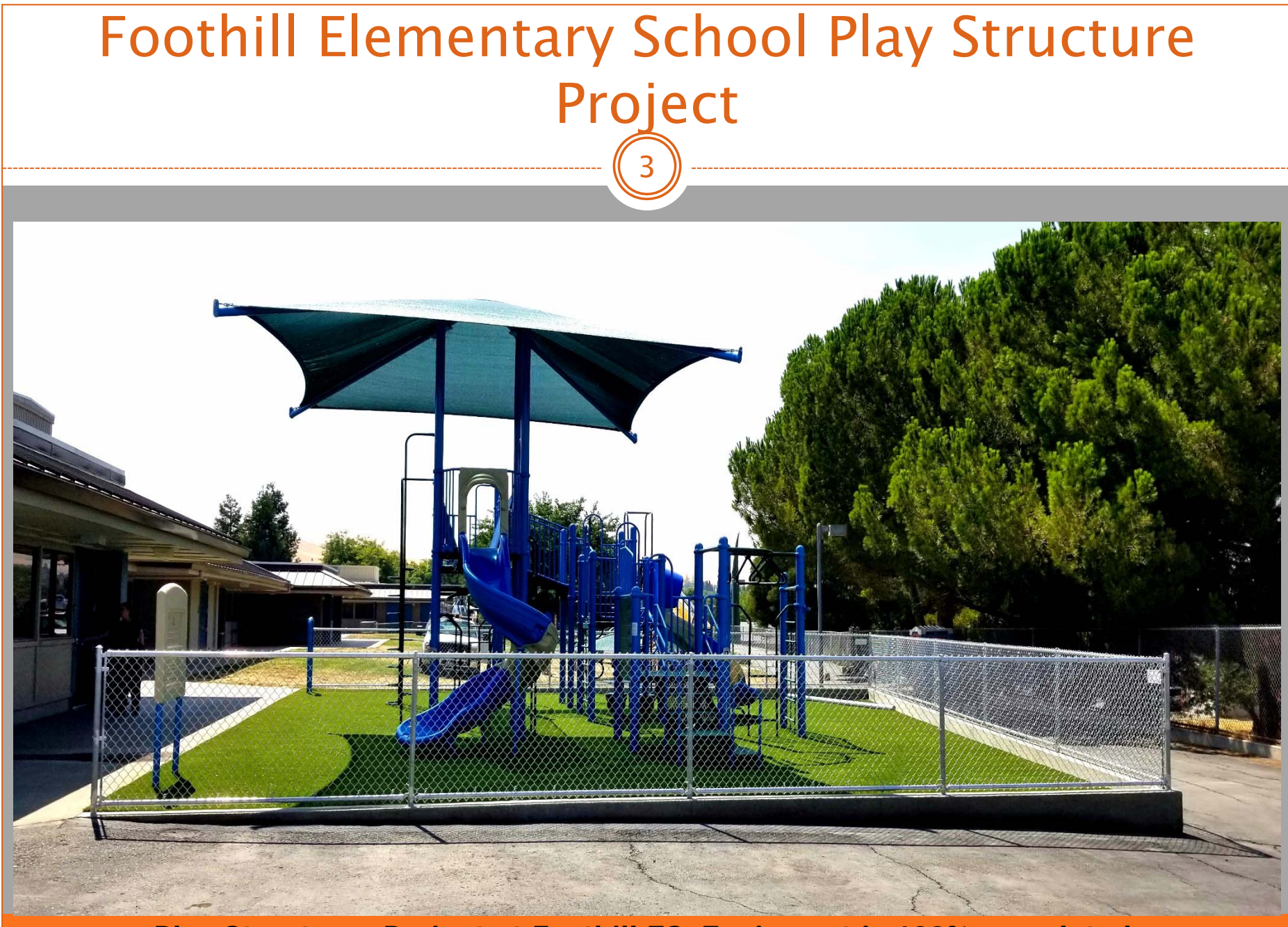
Play Structures Project at Foothill ES: Equipment is 100% completed.