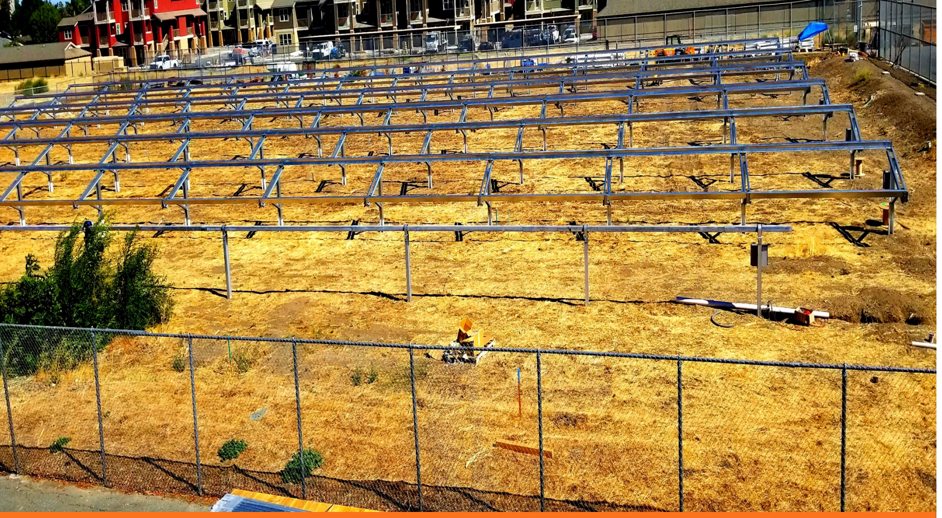
Solar Panels mounting brackets and posts