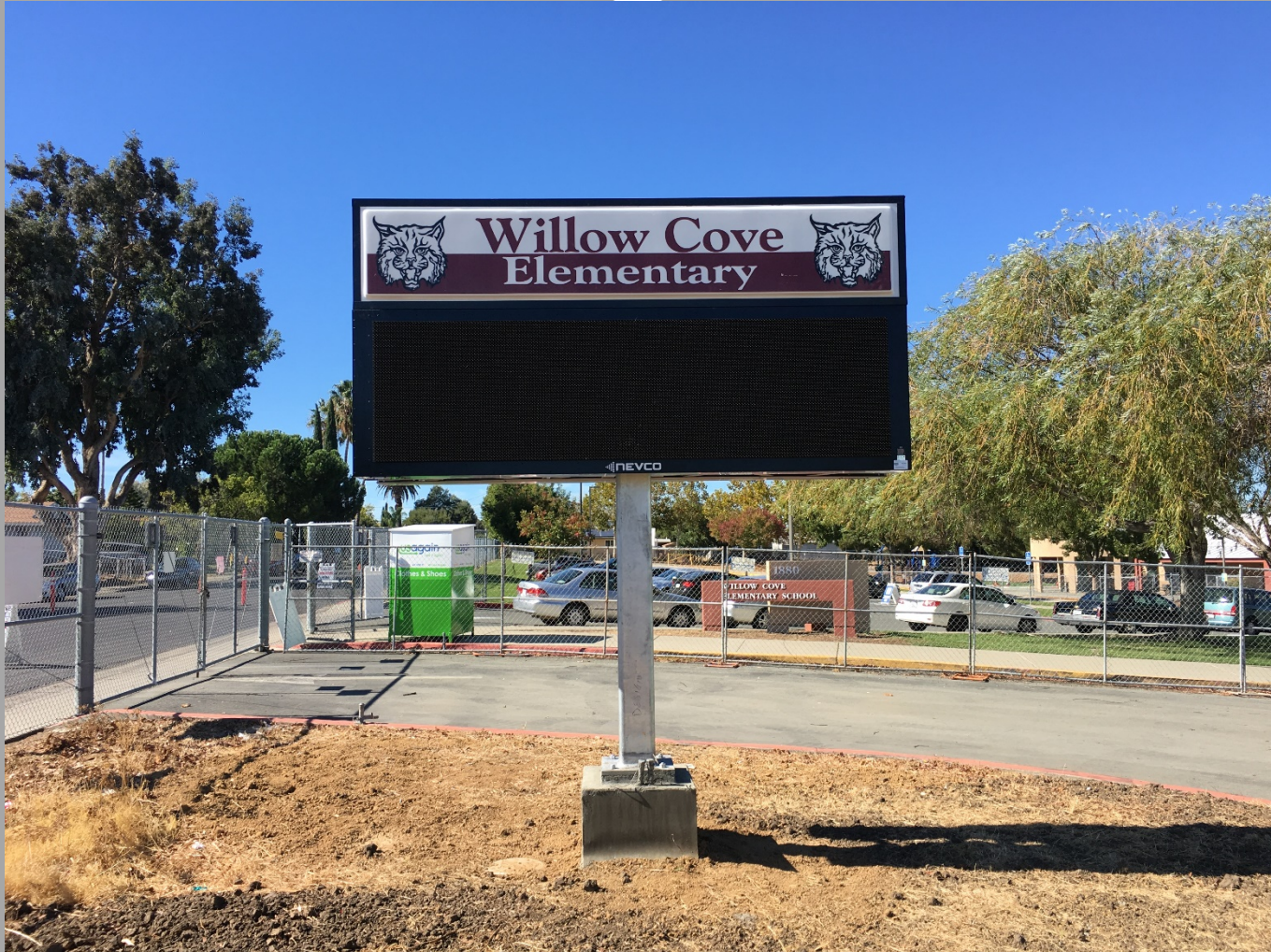
View of New Electronic Marquee Sign