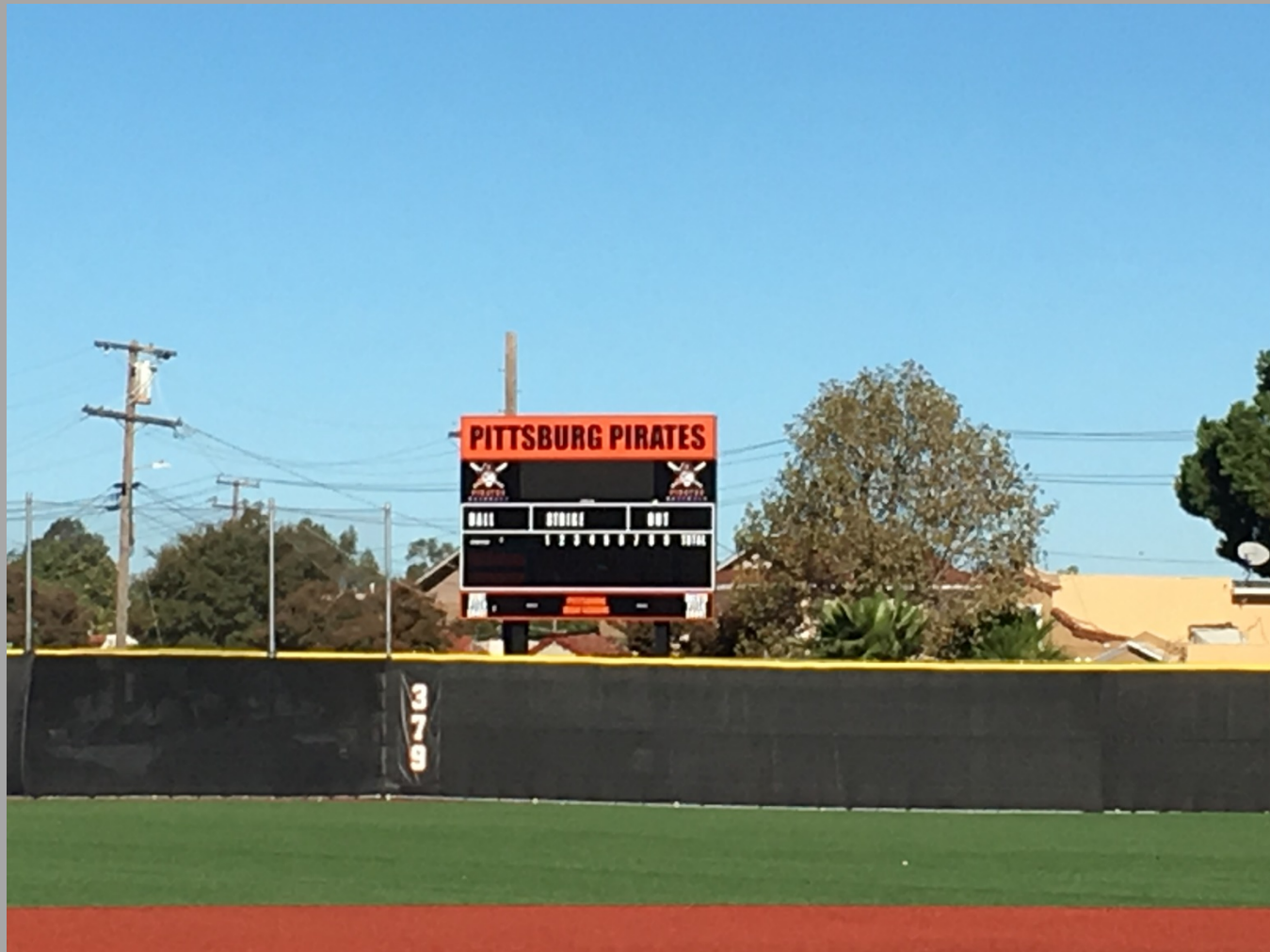
View of New Baseball Scoreboard