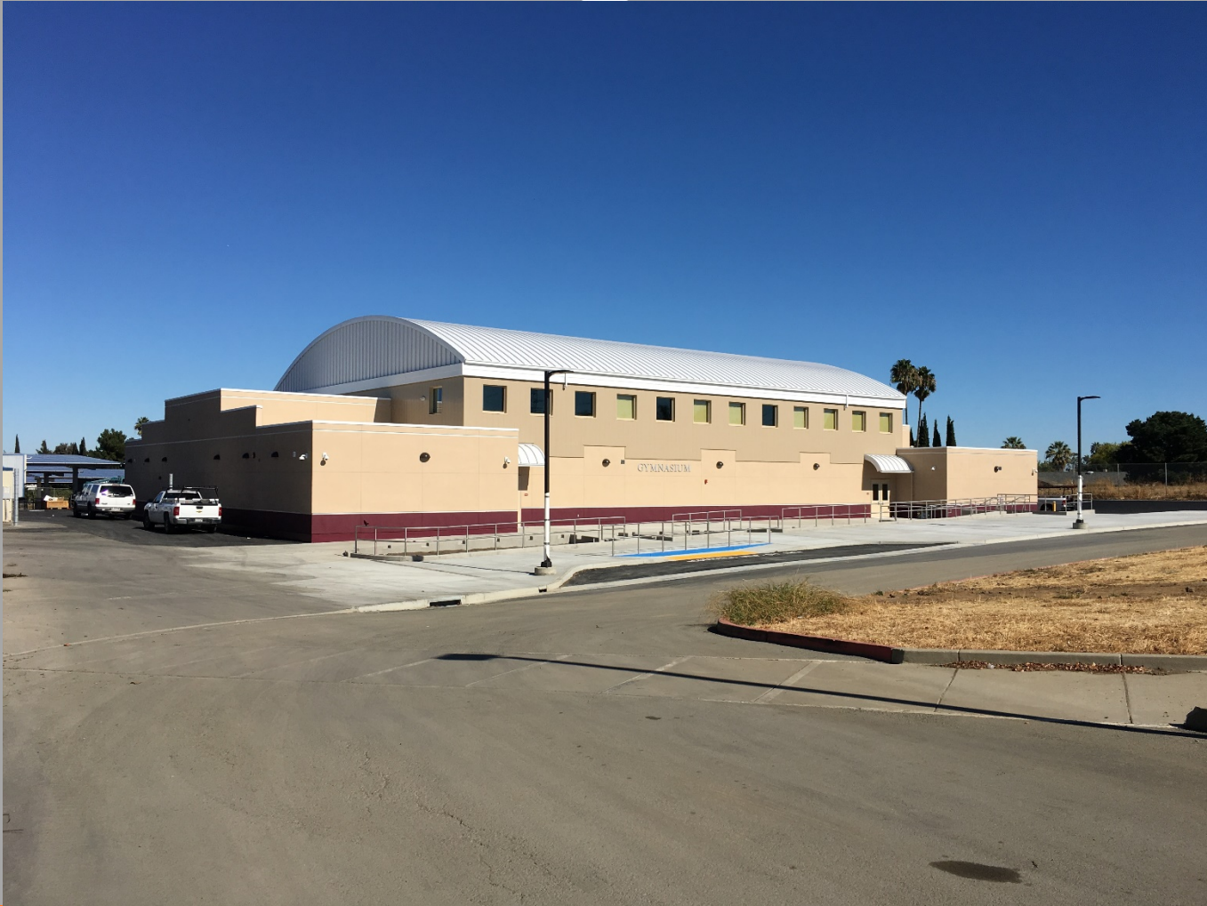
View of New Building Looking Northeast