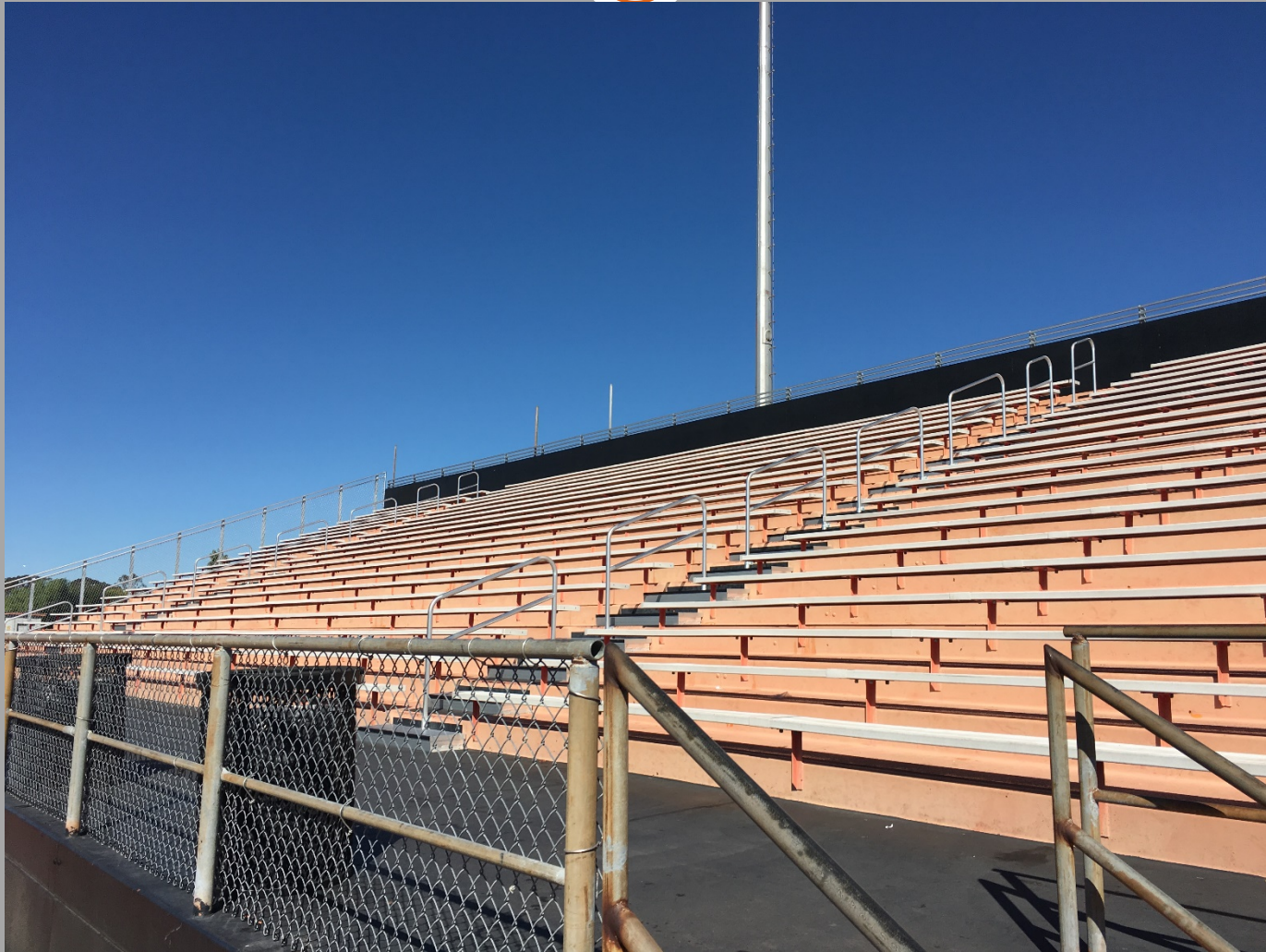
Overall View of Visitor Side Grandstand