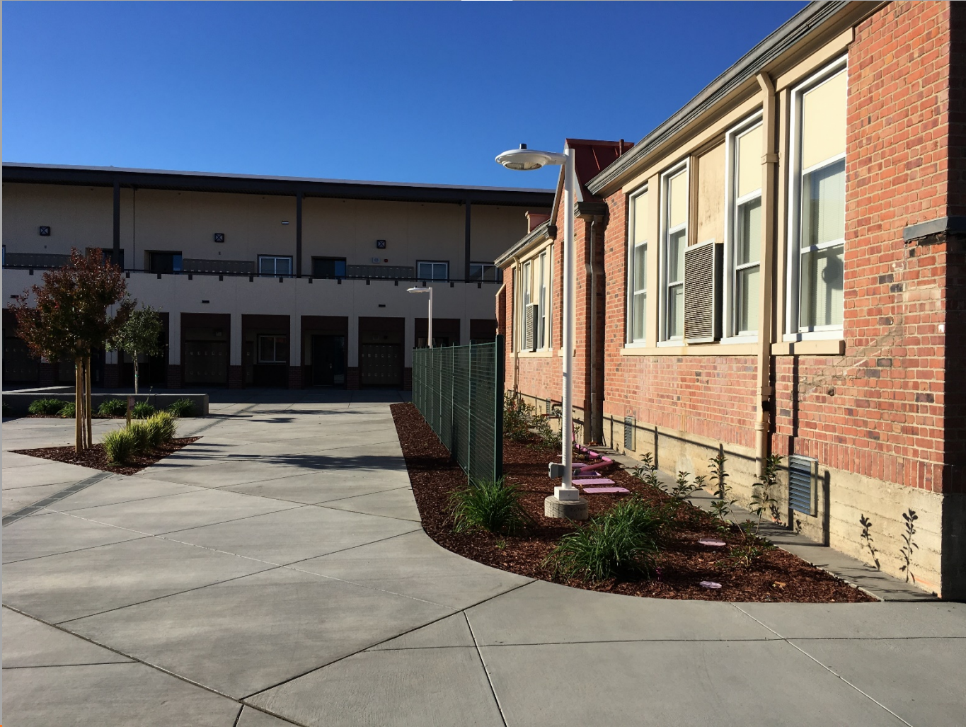
View of Drought Tolerant Landscaping and Living Wall at West Side of Courtyard