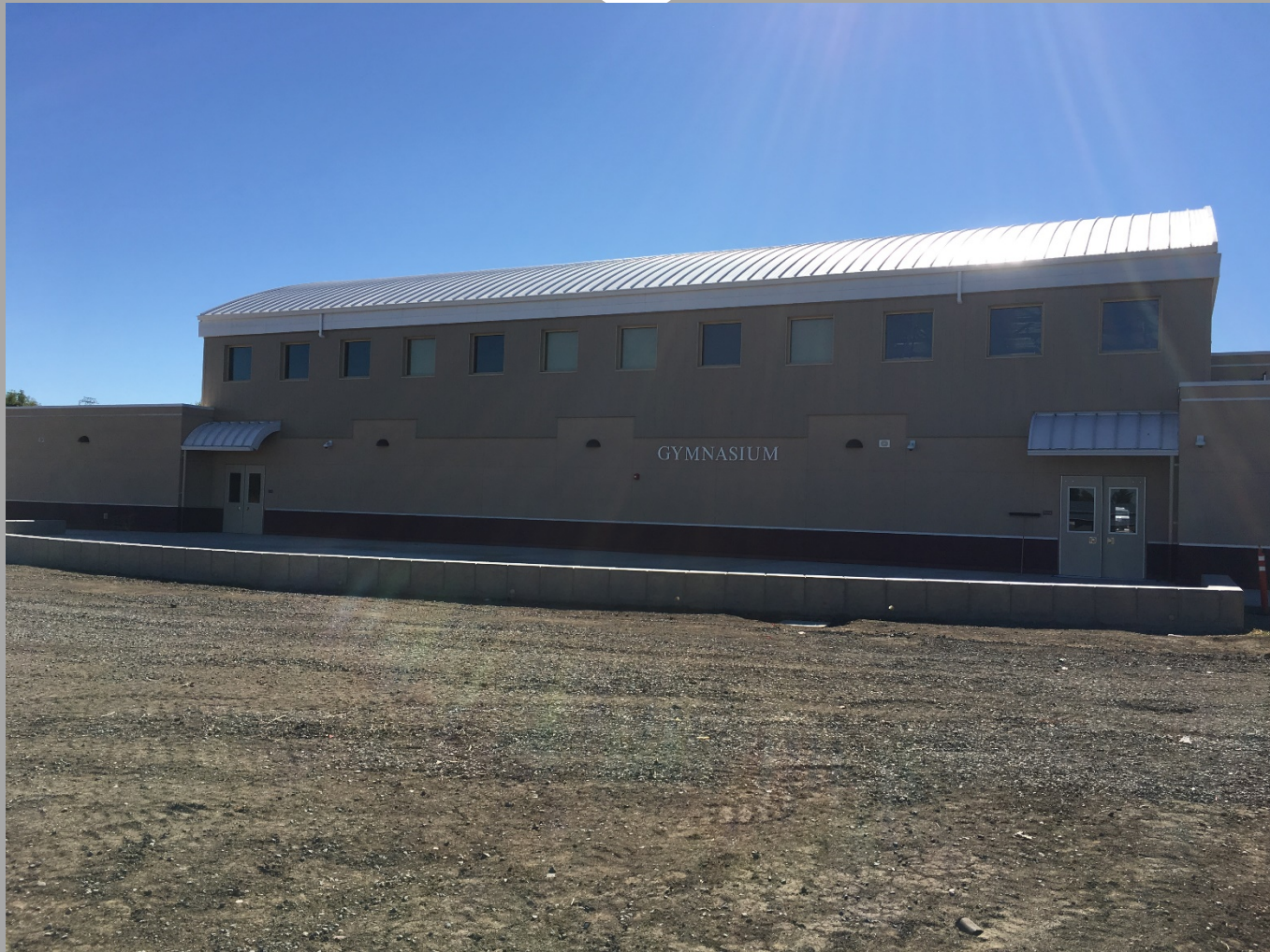
View of Seat-wall at Courtyard