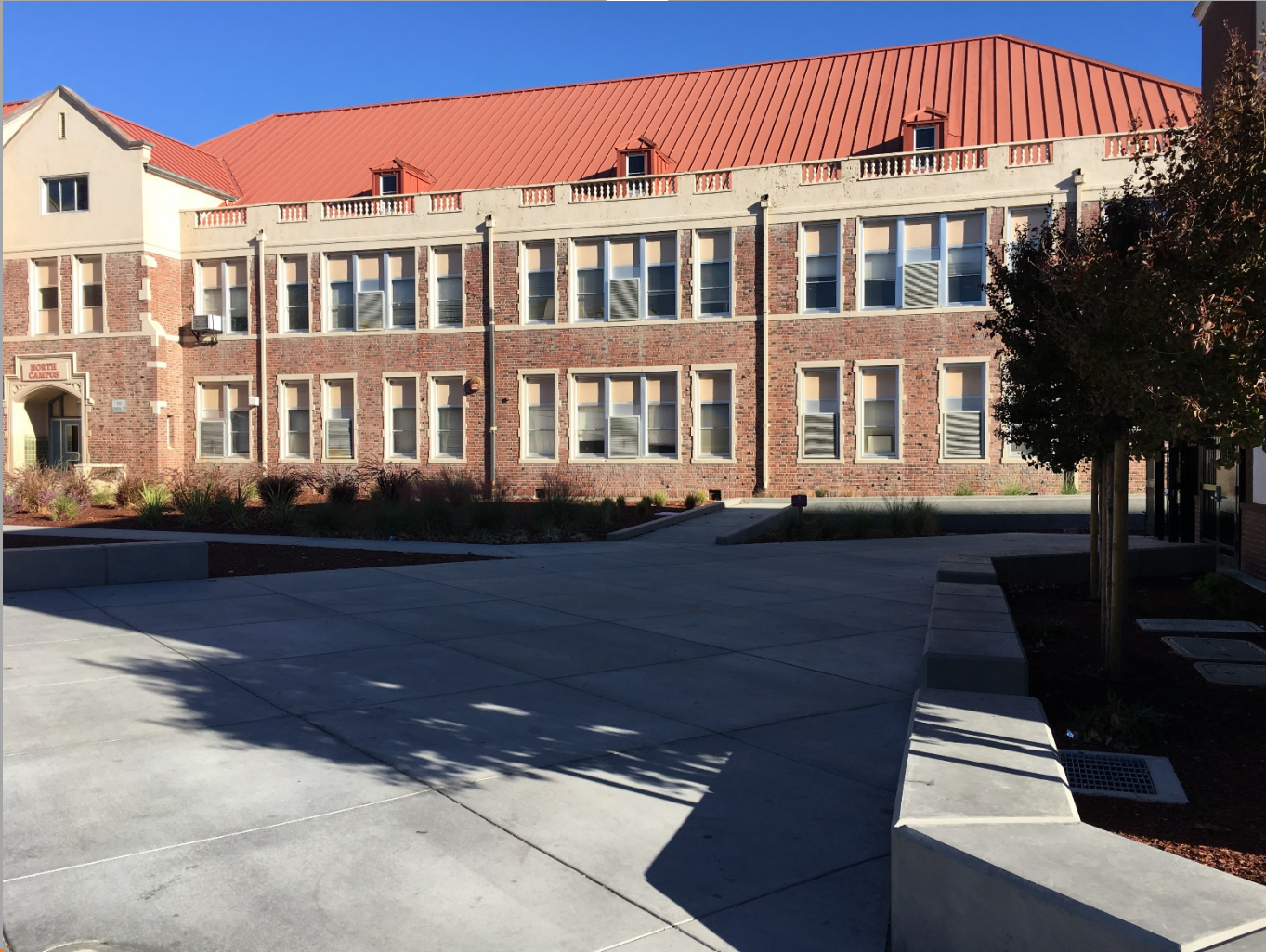
View of Drought Tolerant Landscaping in Front of North Campus Building