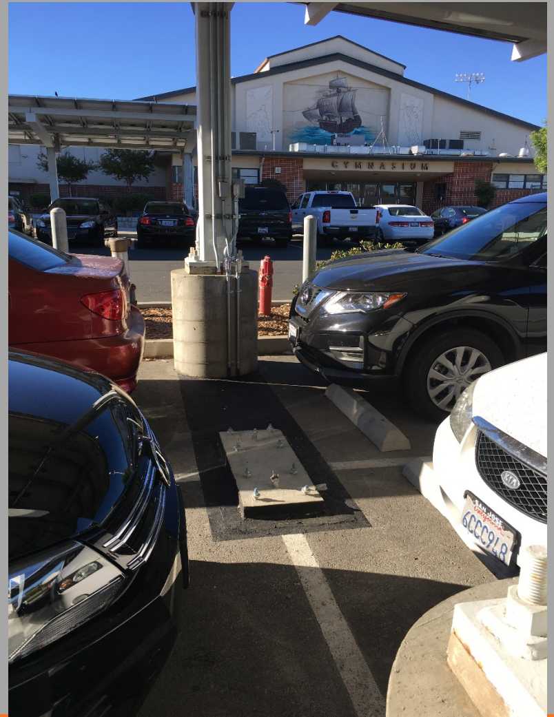
View of Concrete Pedestals for EV Charging Stations