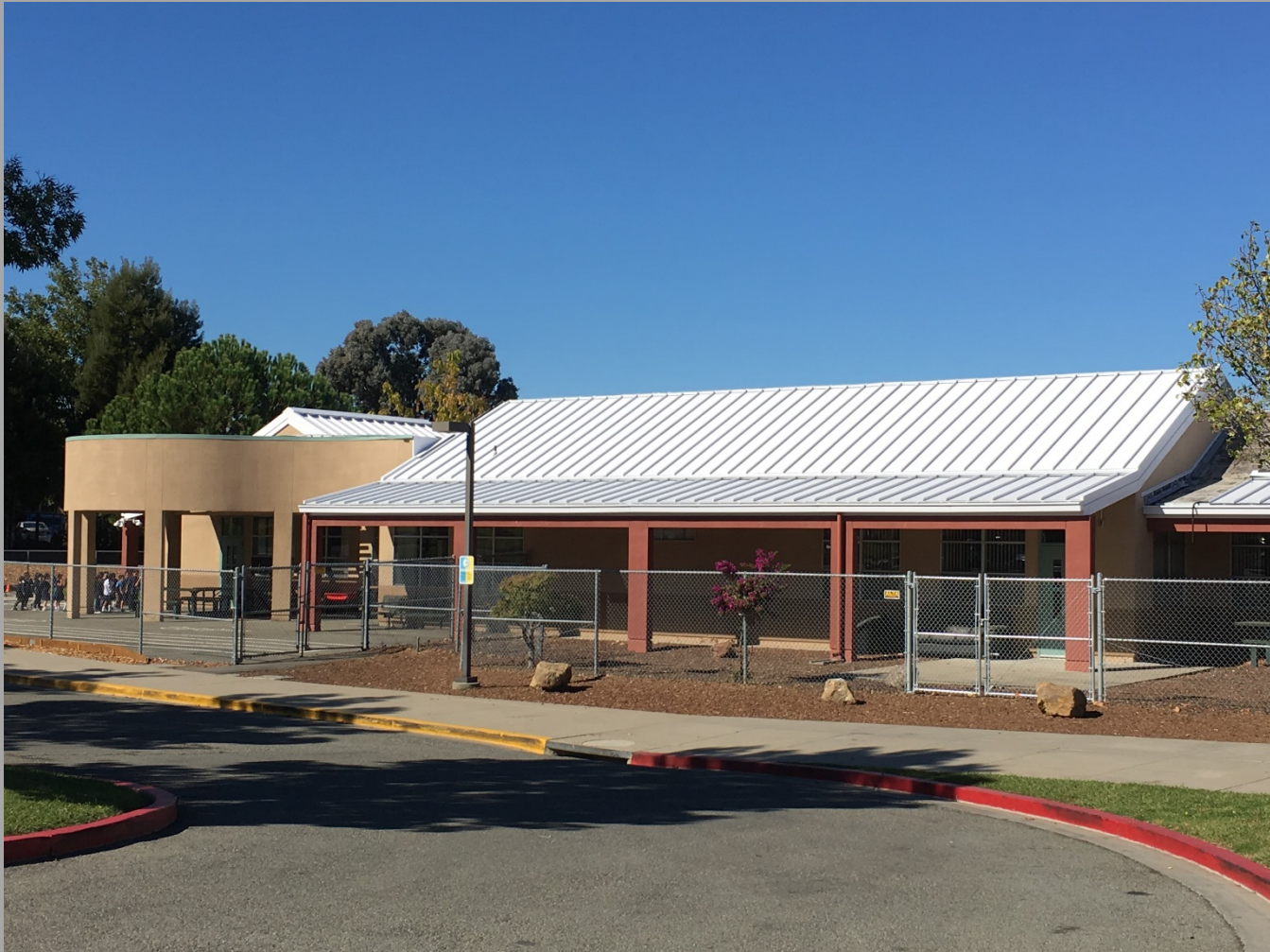
View of New Roofing at Existing School Buildings