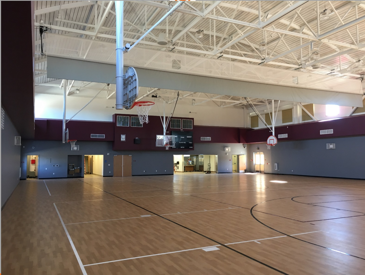
Interior View of New Building Looking East