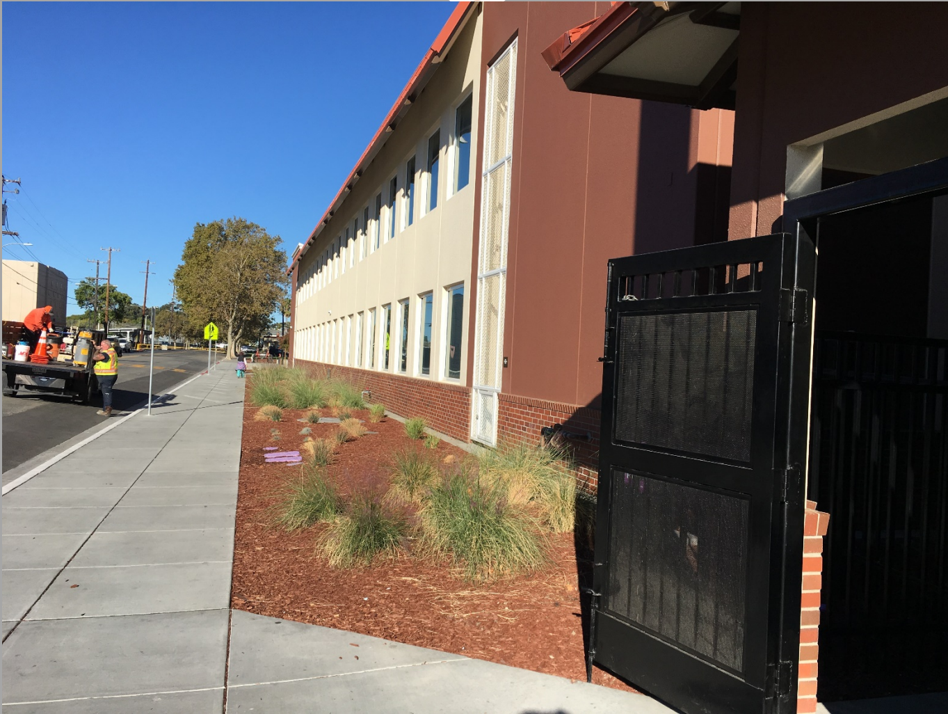
View of Drought Tolerant Landscaping Adjacent to School Street