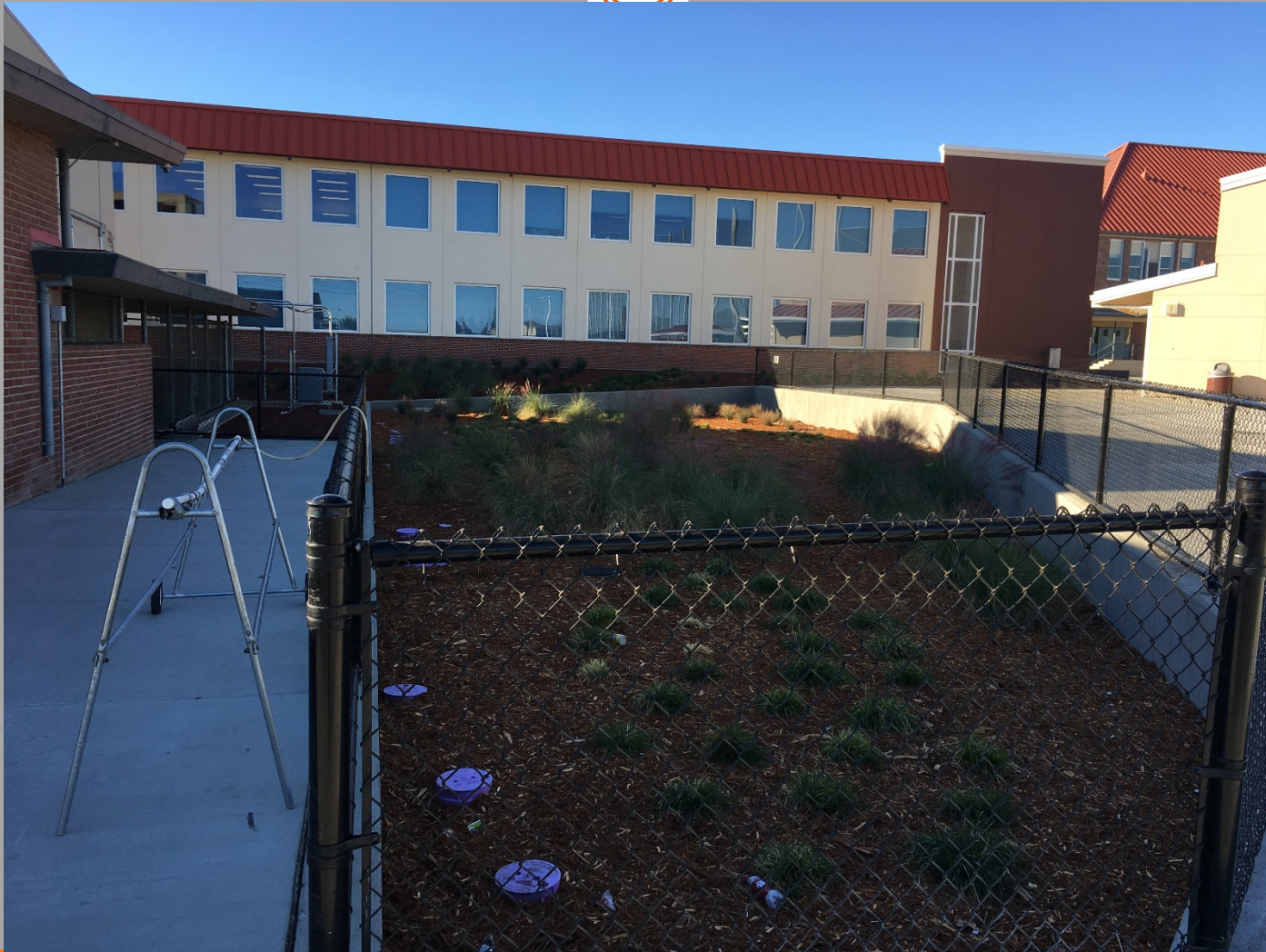
View of Drought Tolerant Landscaping at Bio Retention Pond