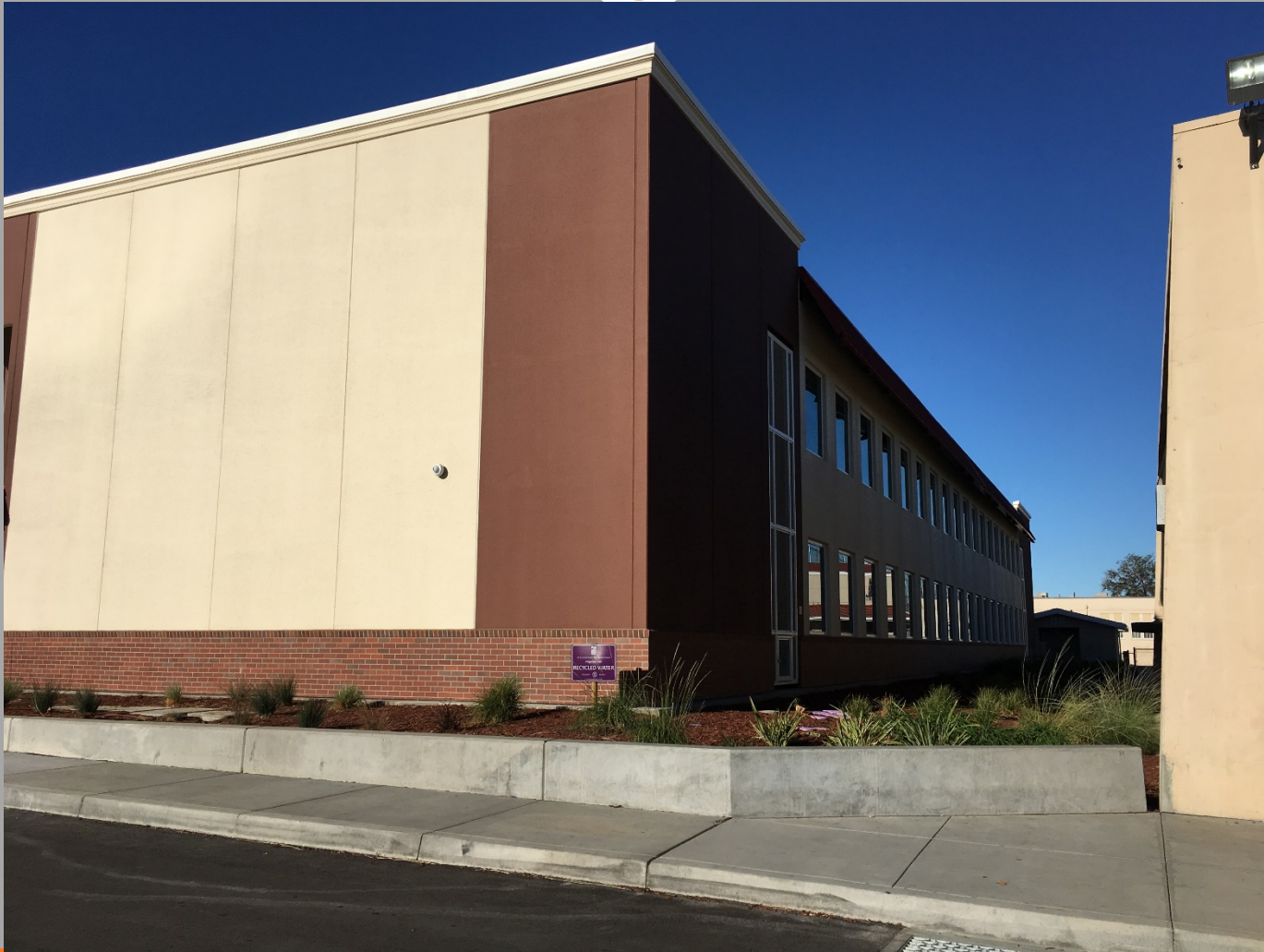
View of Drought Tolerant Landscaping Adjacent to H Parking Lot and Football Building