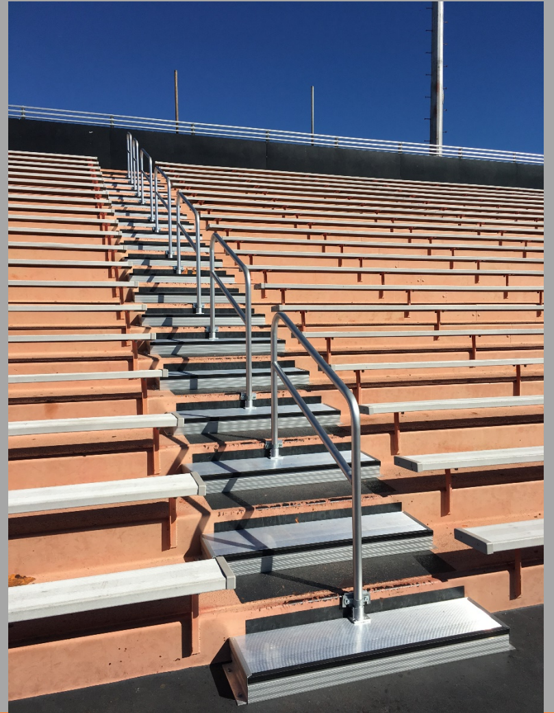
Up-close View of Added Handrails and Steps at Visitor Side Grandstand