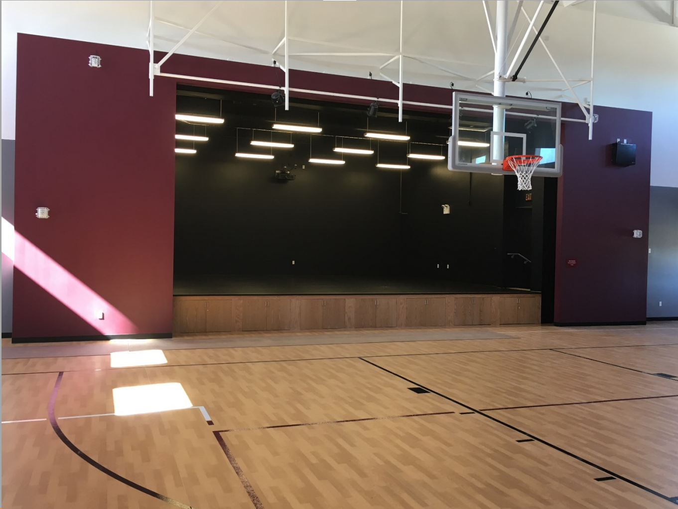
Up-close View of Platform