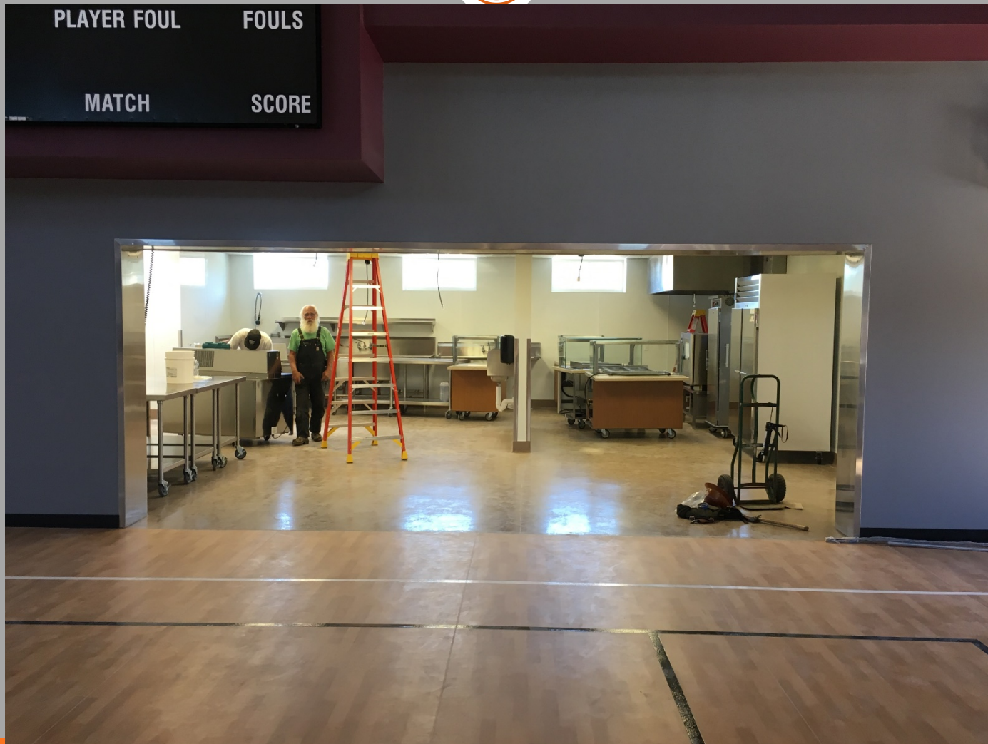
Up-close View of Kitchen