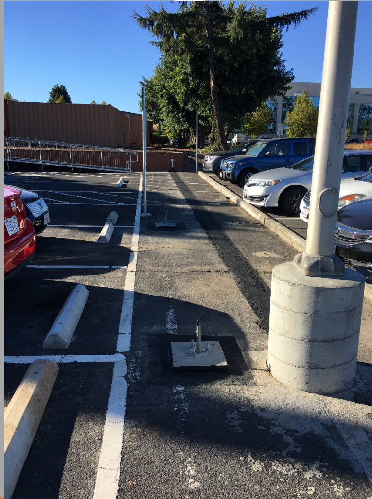
View of Concrete Pedestals for EV Charging Stations