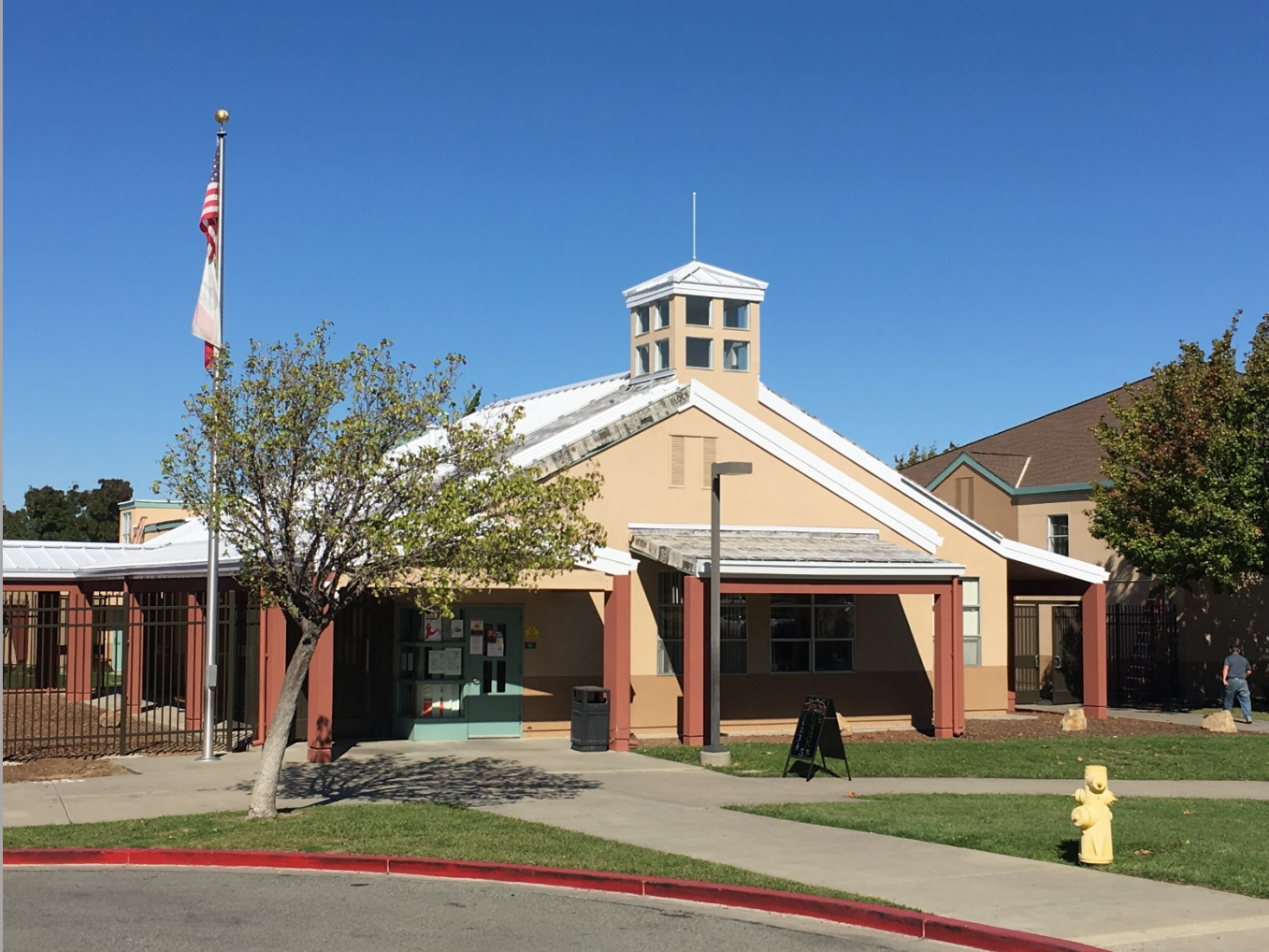
View of New Roofing at Existing School Buildings