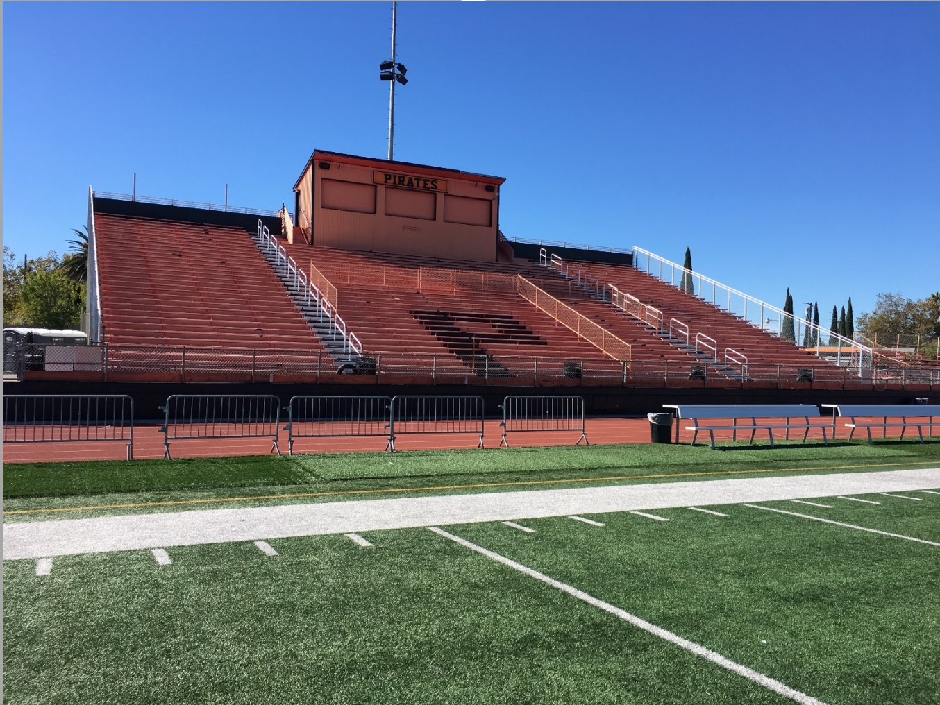
Overall View of Stadium Home Side Grandstand