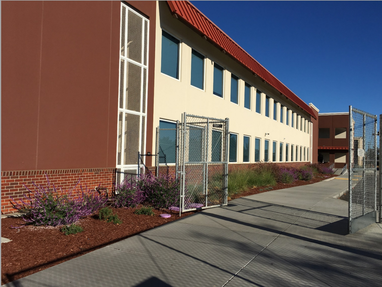
View of Drought Tolerant Landscaping Adjacent to H Parking Lot