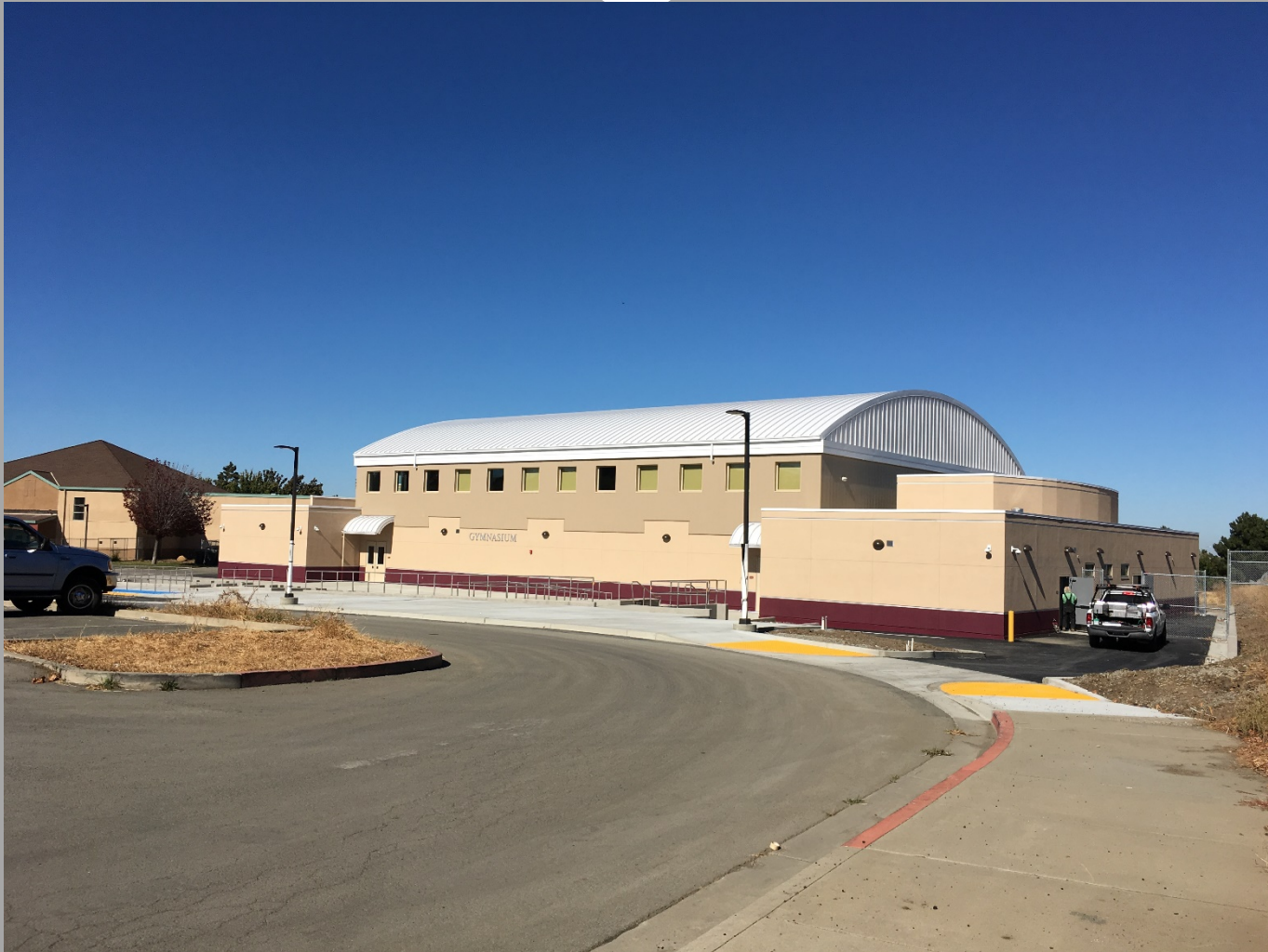
View of New Building Looking Northwest