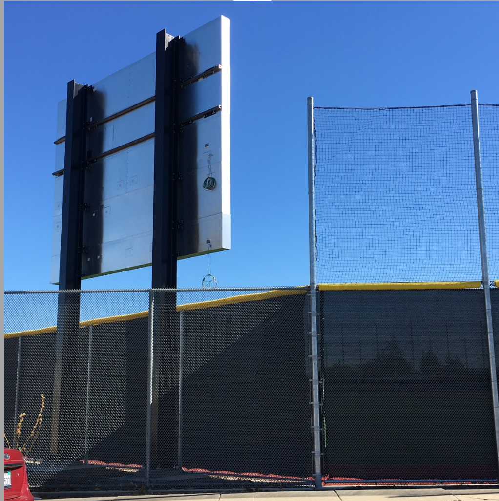
View of New Baseball Scoreboard Structure