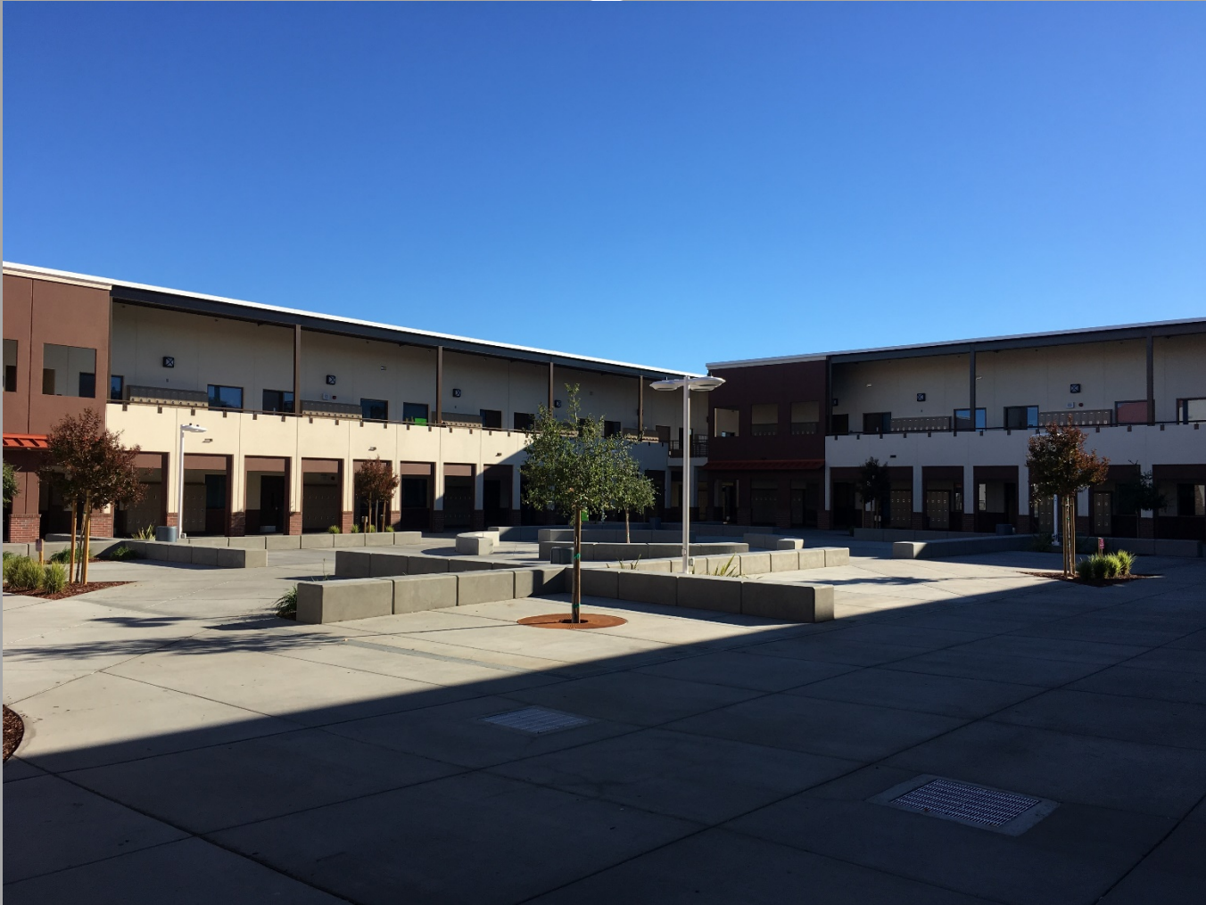
View of Drought Tolerant Landscaping at Courtyard