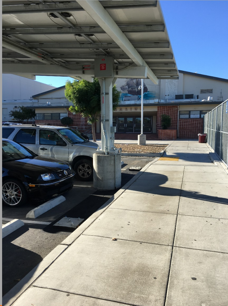
View of Concrete Pedestals for EV Charging Stations