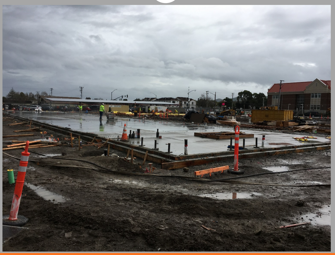
New 12 Classrooms Bldg. (Bldg. N1) Slab Poured - Looking Southeast