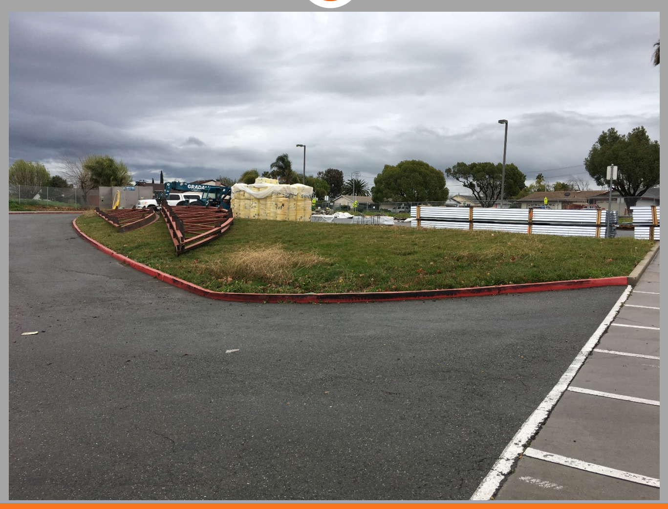
New Gym./MP Bldg. Roof Trusses On Site and Ready for Installation