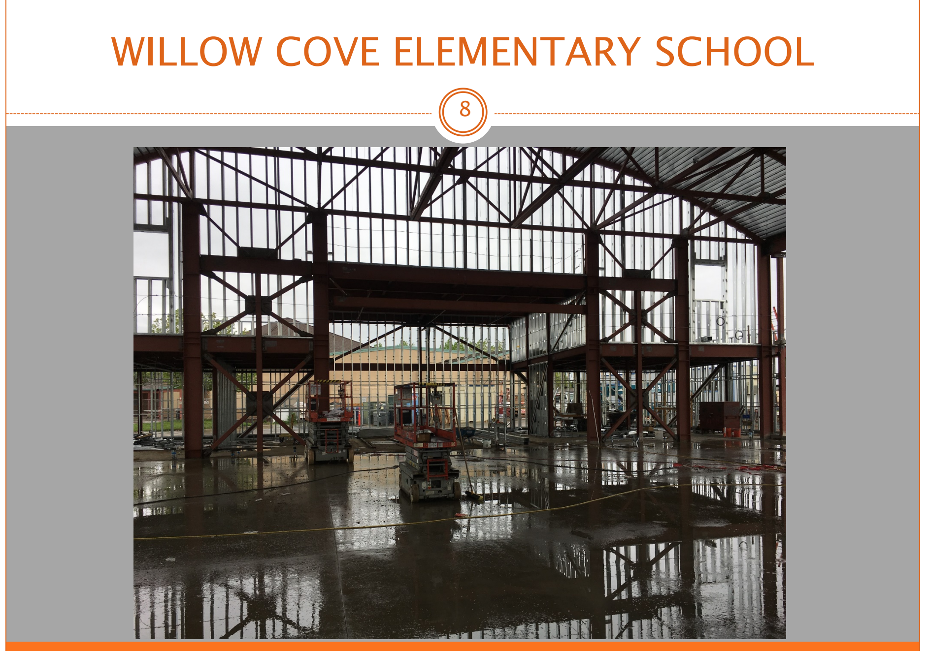
New Gym/MP Bldg. Interior View Of West Wall Gym/MP Space Wall