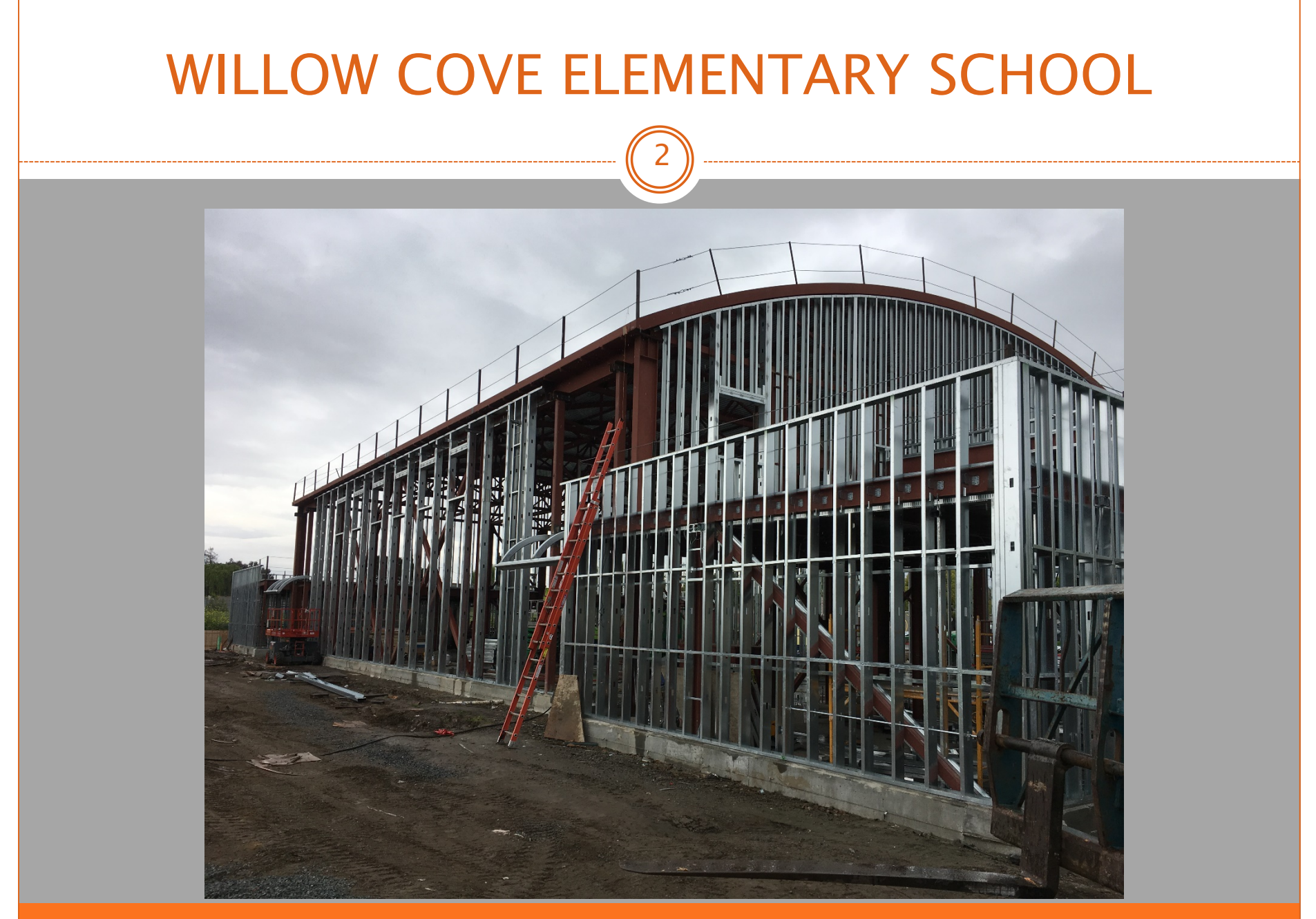
New Gym/MP Bldg. Exterior Walls Framing Ongoing- Looking Southeast