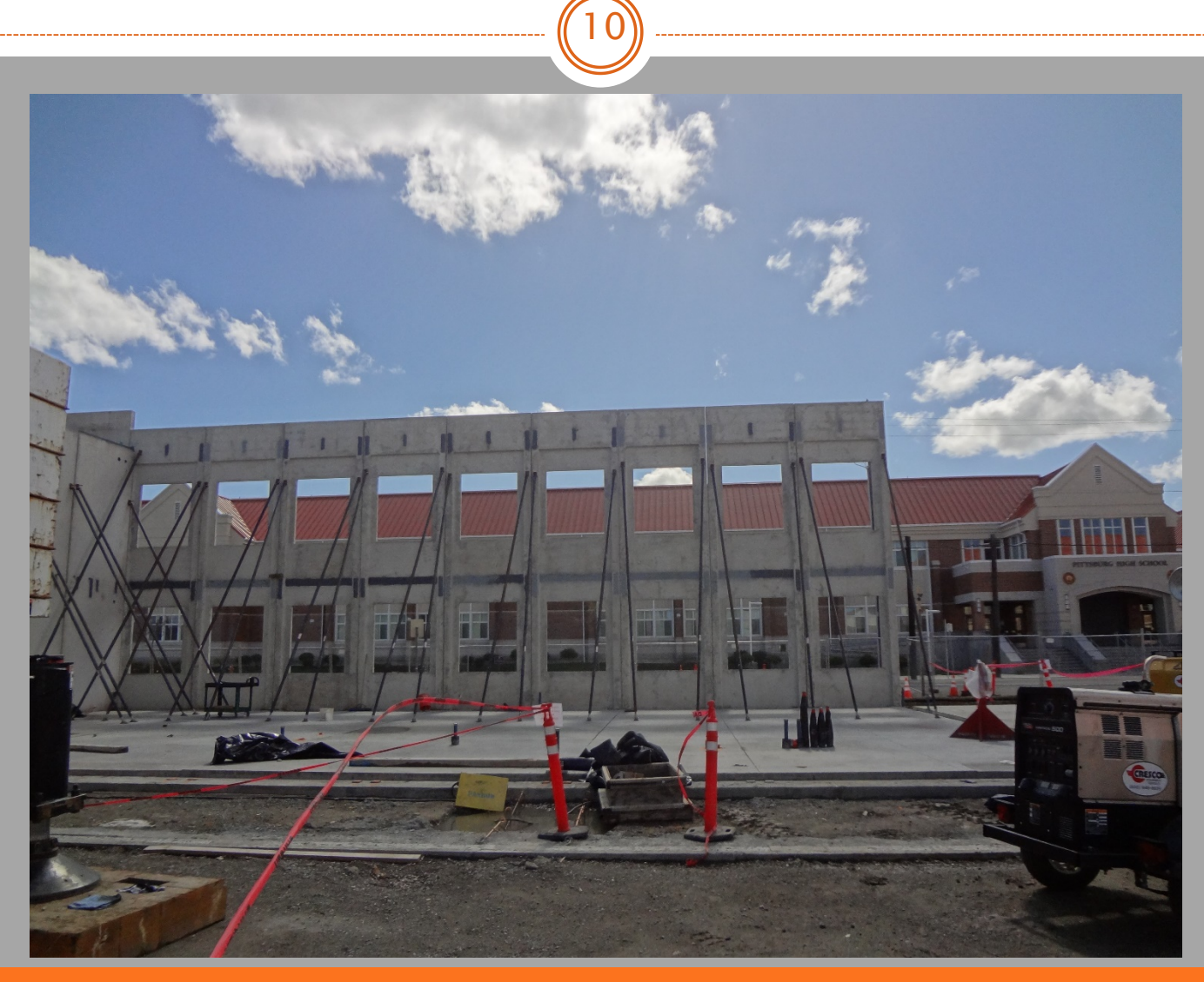
New 8 Classrooms Bldg. (Bldg. N3) South Exterior Wall Panels In Place