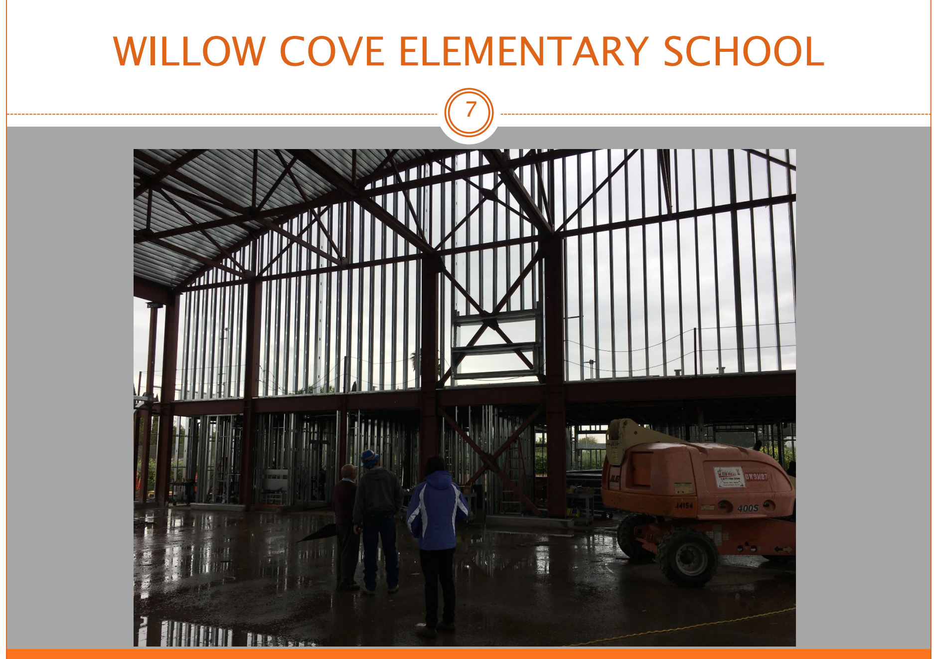
New Gym/MP Bldg. Interior View Of East Gym/MP Space Wall