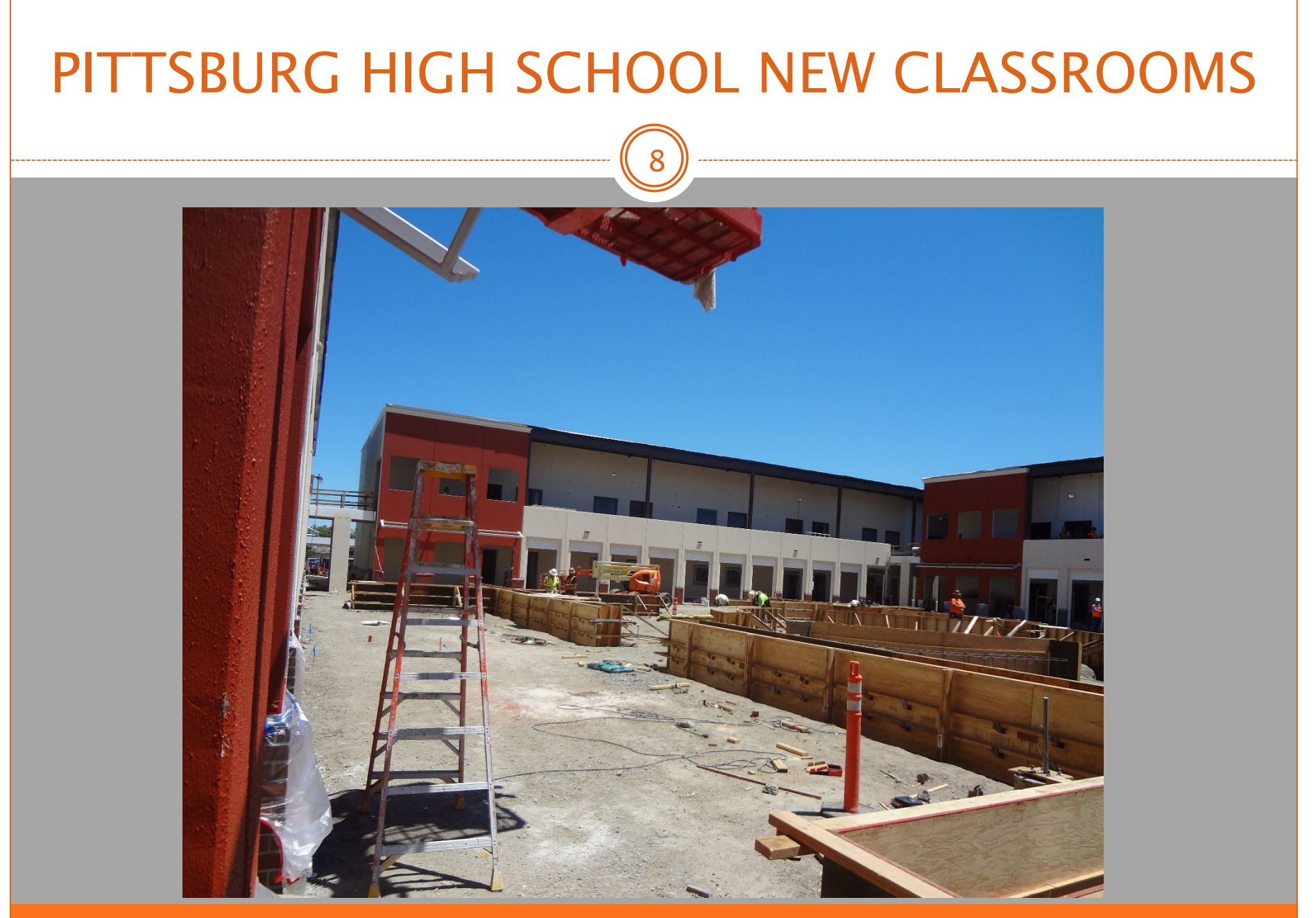
View Of Building N2 & N3 & Formwork Ongoing In Courtyard