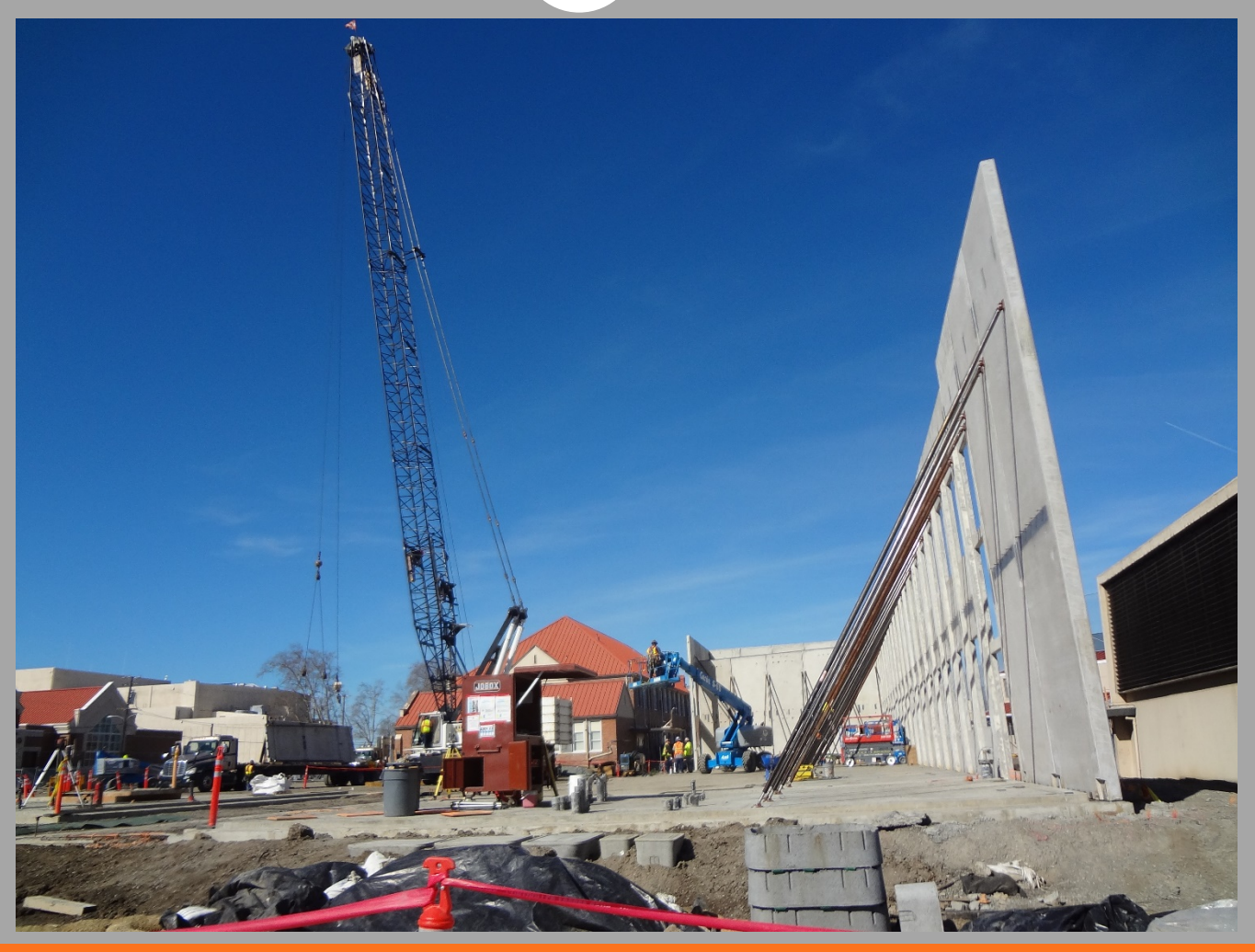
New 12 Classrooms Building (Bldg. N1) North Exterior Wall Panels Installation