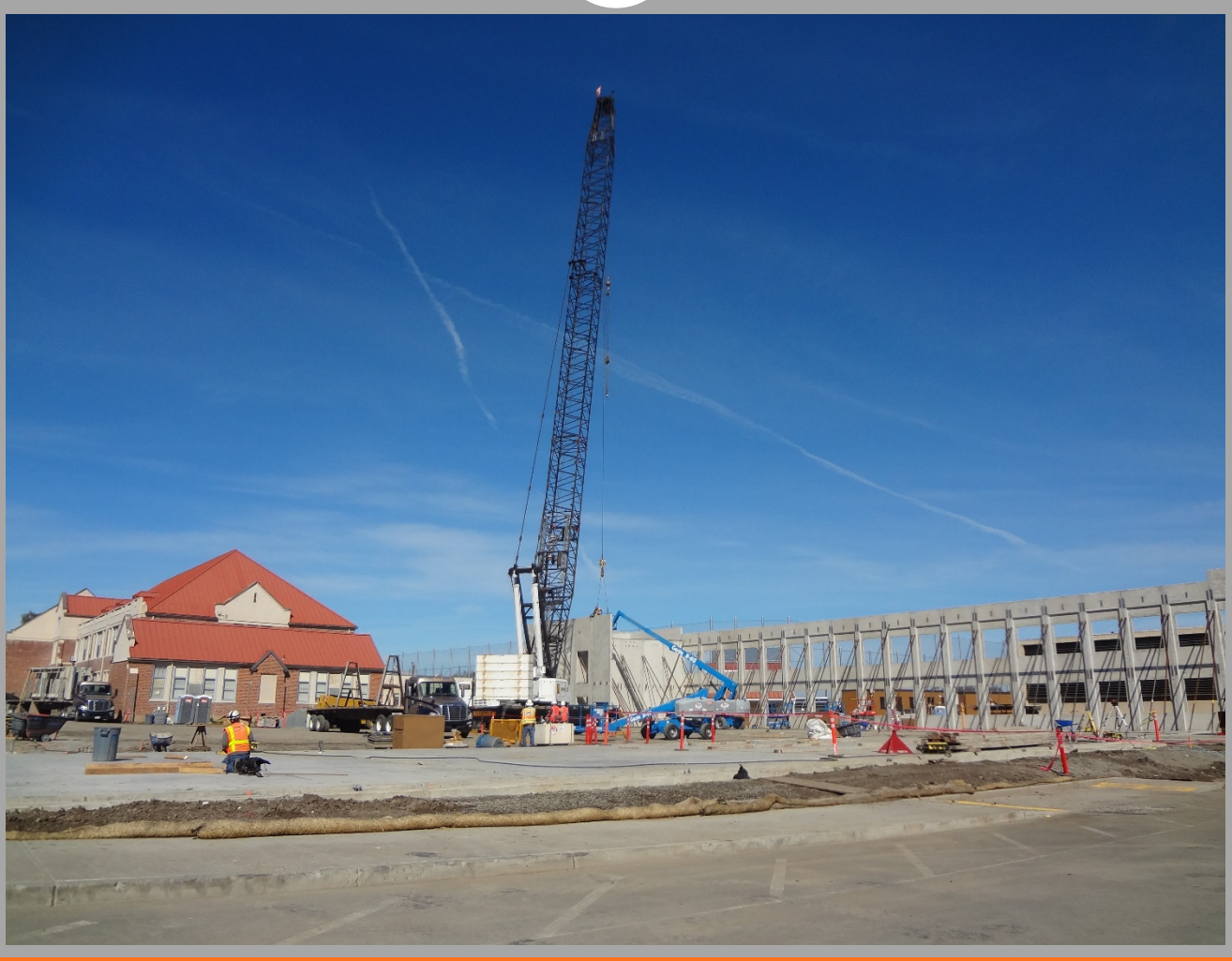
New 12 Classrooms Bldg. (Bldg. N1) Overall View Of Exterior Wall Panels In Place