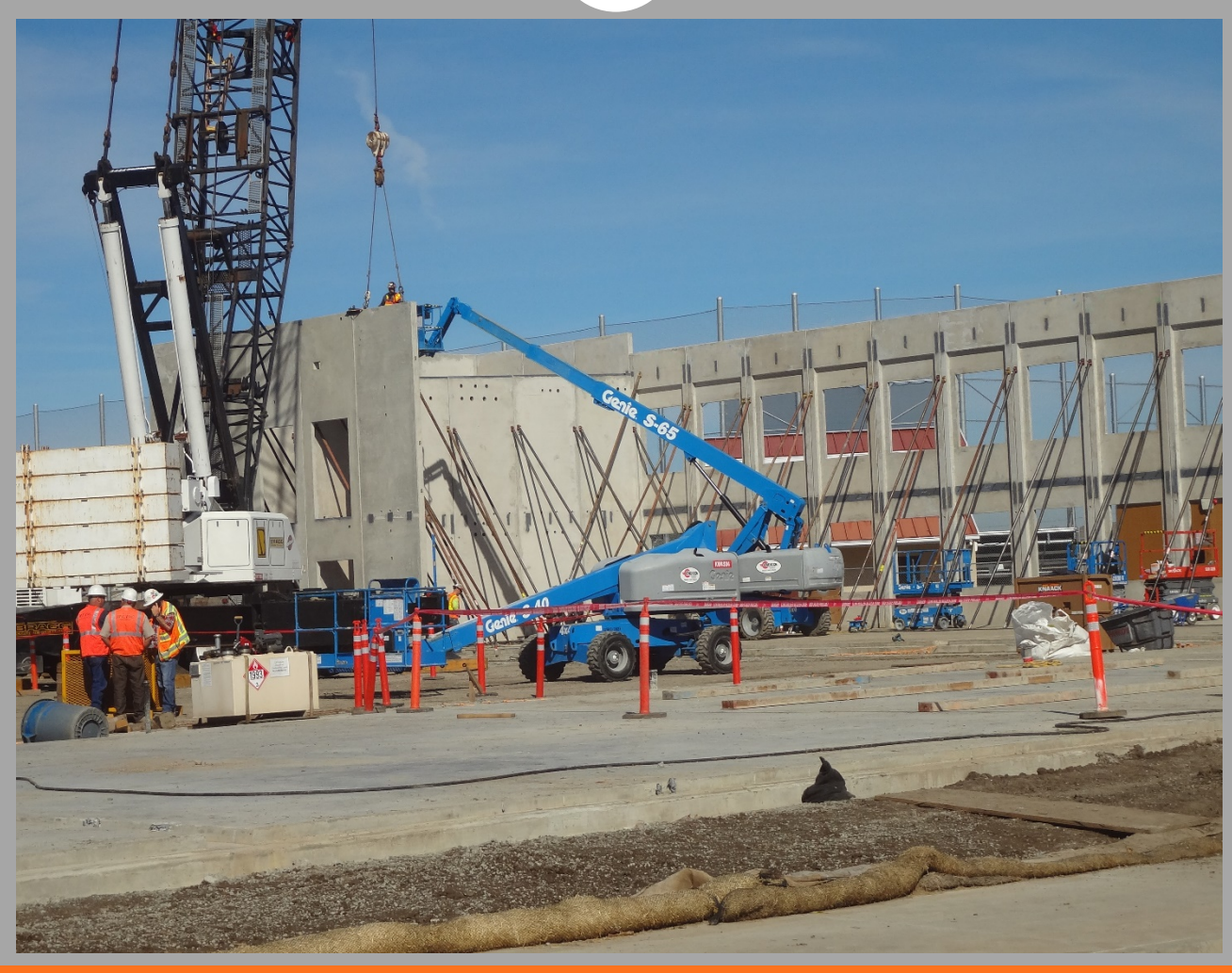
New 12 Classrooms Bldg. (Bldg. N1) South Exterior Wall Panel In Place & Being Leveled