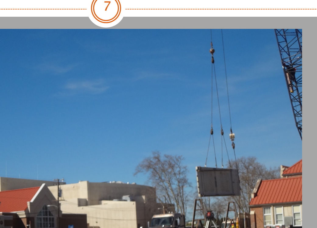
New 12 Classrooms Bldg. (Bldg. N1) Exterior Wall Panel Being Unloaded & Craned Into Place