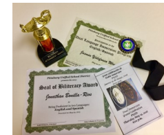
Awards for Achievement in Dual Language Immersion at the annual Gran Celebration.

English Learner (EL) students in the Dual Language Immersion program have the same opportunities to reclassify to Fluent English Proficient (R-FEP) as EL students in other programs.