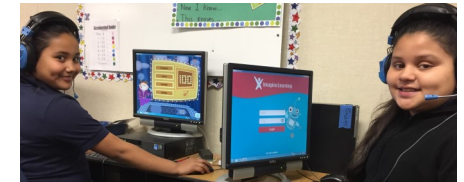
New technologies to advance their learning in English and Spanish