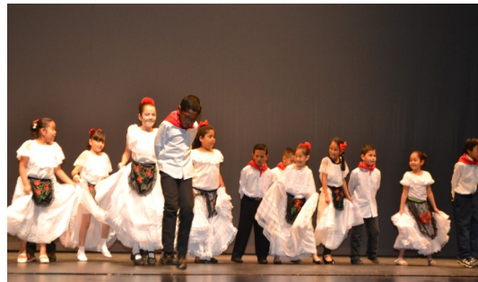
Dual Language students at "La gran celebración"